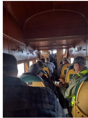
Other passengers on the 1 st flight on Saturday