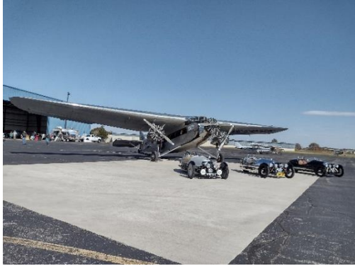
3 Morgans came out to visit the Trimotor