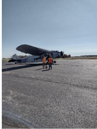
Lesson on engine starting