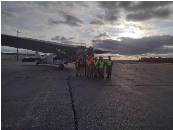
Our CAP Crew