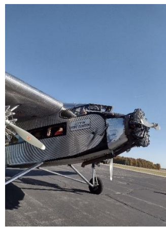
The young lady in the co pilot's seat is an Aviation student at Bowling Green.