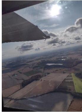
A beautiful morning