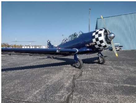
A beautiful T-6 Texan