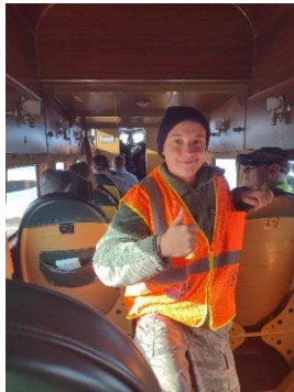
One of the CAP kids