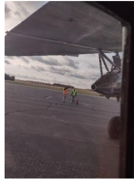
Learning about engine start