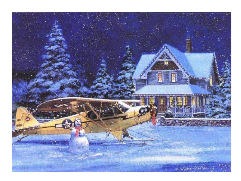
Have a safe and Merry Christmas.