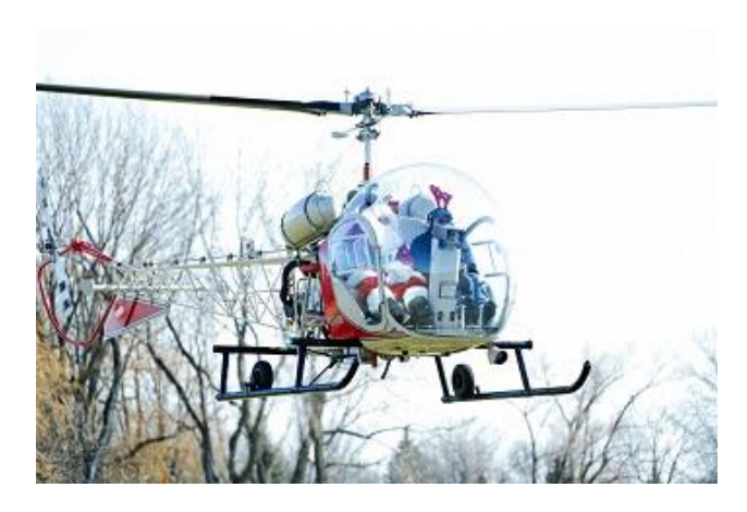
EAA Aviation Museum events bring festive air to 2024 holiday season.

EAA AVIATION CENTER, OSHKOSH, Wisconsin — (November 13, 2024) — The EAA Aviation Museum brings excitement and joy to the holiday season in Northeast Wisconsin with several events scheduled between Thanksgiving and the new year.