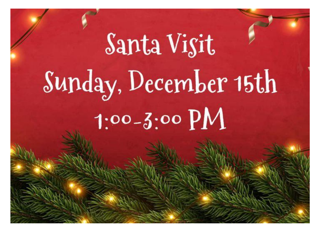
Check the Airport's Facebook page for updates!