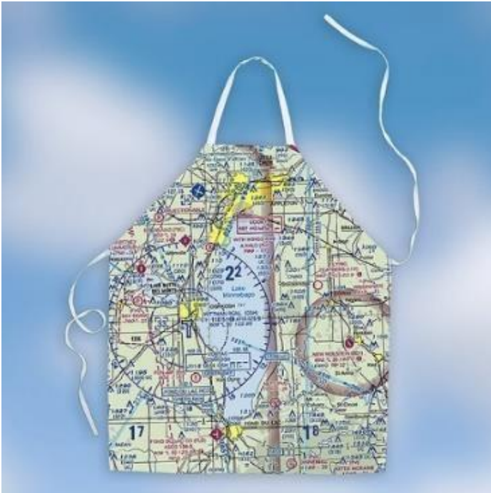
Custom U.S. Aeronautical Chart Apron