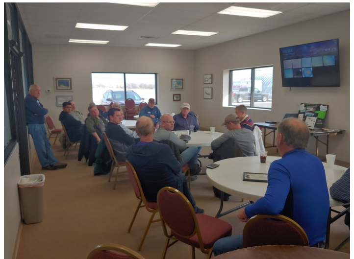
A Packed House