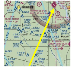
David J. Perry Airport (1K4)