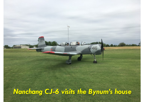
Nanchang CJ-6 visits the Bynum's house