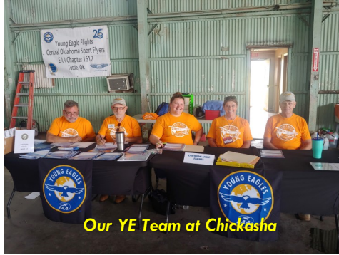
Our YE Team at Chickasha