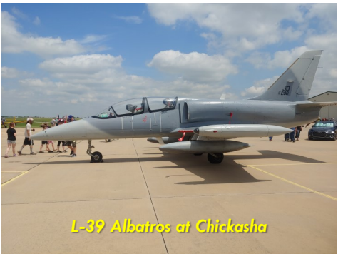
L-39 Albatros at Chickasha