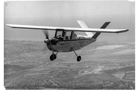
Here is the July 2022 "What is it?"

The aircraft was used by Sierradyne in the 1960s to test and promote Northrop's boundary layer control concepts. Northrop used it as a flying technology demonstrator for the Air Force's AX close-support aircraft design competition in 1972. The plane was never officially considered a Northrop aircraft and that is the rest of the story.