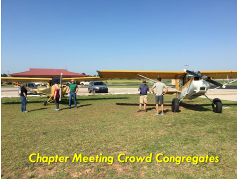
Chapter Meeting Crowd Congregates