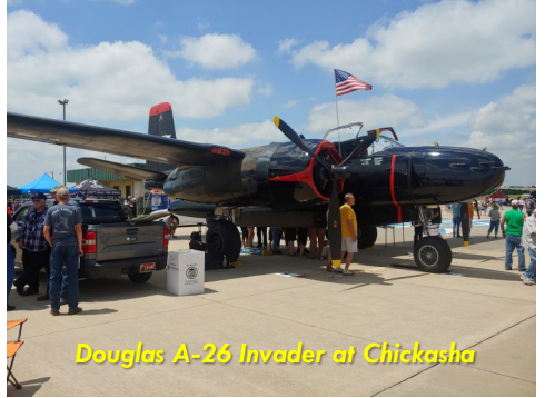
Douglas A-26 Invader at Chickasha