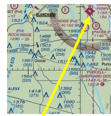
David J. Perry Airport (1K4)