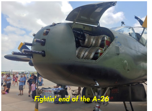
Fighting end of the A-26