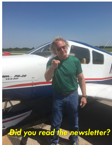
Did you read the newsletter?