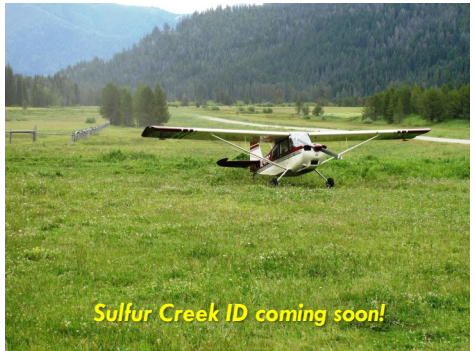
Sulfur Creek ID coming soon!