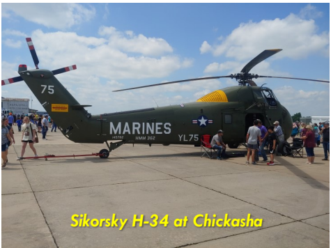
Sikorsky H-34 at Chickasha