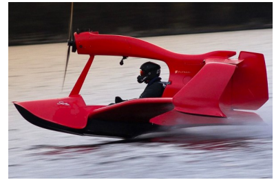
Here is the November 2022 "What is it?"