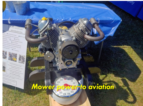
Mower power to aviation