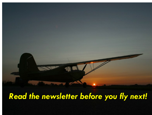
Read the newsletter before you fly next!