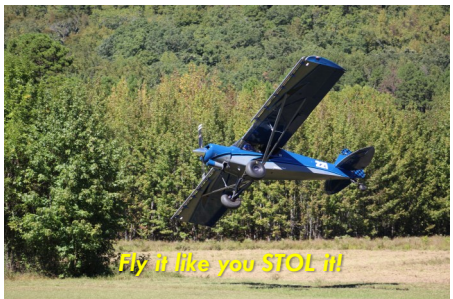
Fly it like you STOL it!