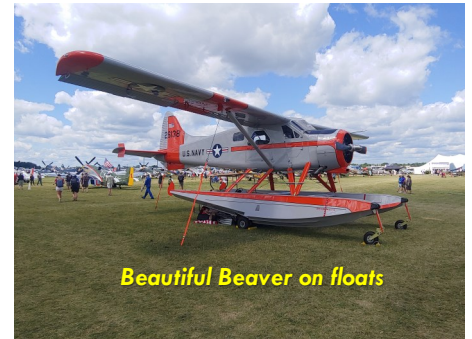
Beautiful Beaver on floats