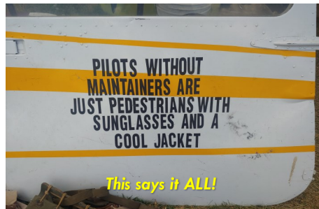
This says it ALL!