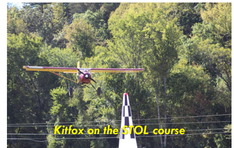
Kitfox on the STOL course