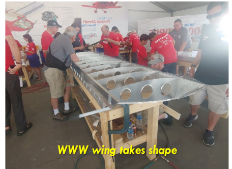
WWW wing takes shape