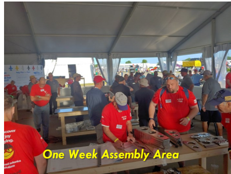
One Week Assembly Area