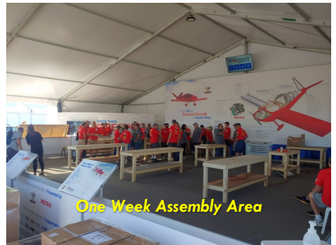
One Week Assembly Area