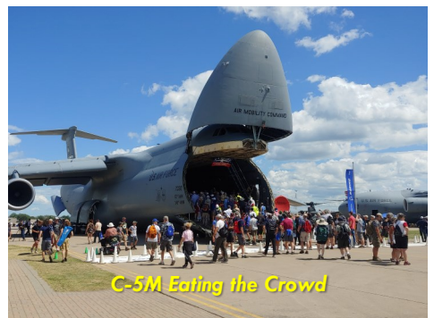
C-5M Eating the Crowd