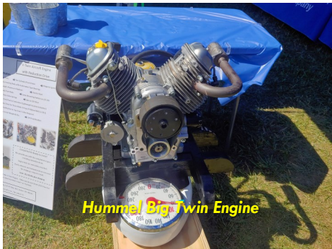
Hummel Big Twin Engine