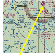
David J. Perry Airport (1K4)