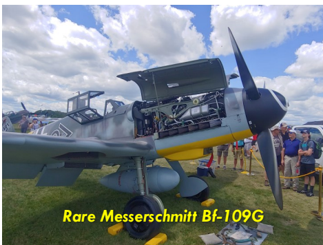
Rare Messerschmitt Bf-109G