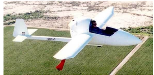
Here is the September 2022 "What is it?"