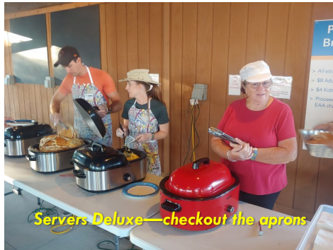
Servers Deluxe—checkout the aprons