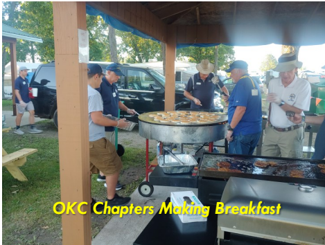
OKC Chapters Making Breakfast