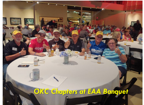
OKC Chapters at EAA Banquet