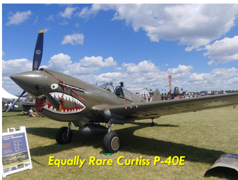
Equally Rare Curtiss P-40E