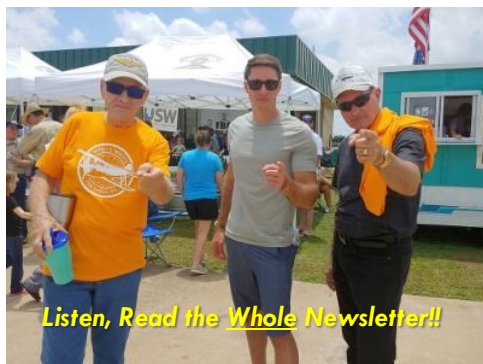
Listen, Read the Whole Newsletter!!