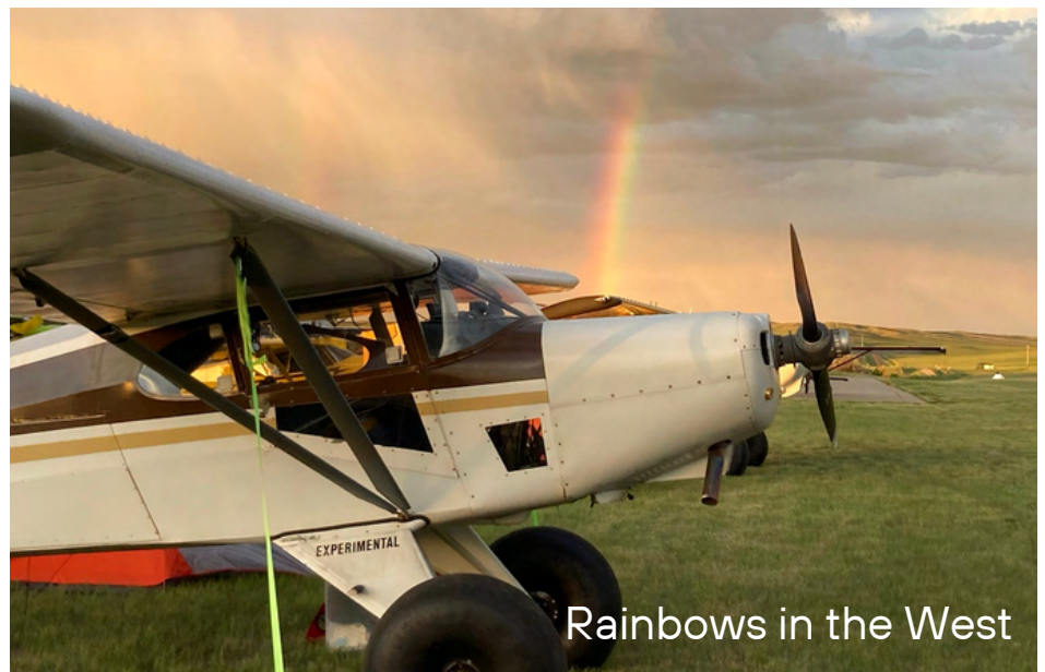
Rainbows in the West