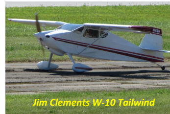
Jim Clements W-10 Tailwind

One could build the Wittman W-10 wing without flaps and use the Wittman trapezoidal wingtips for better stall and cruise speed. Lowell Johnson's Cougar (see Apr 65 Sport Aviation pg 36-37) had a power-off stalling speed of 55 mph at a 1400 lb gross weight and with the W-8 wing span of 20 feet. I believe you could easily hit the 51 mph stall limit for light sport aircraft with the larger Wittman W-10 wing (24 ft) and would only have to limit the max