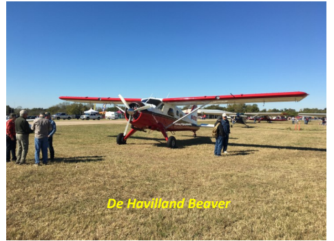
De Havilland Beaver