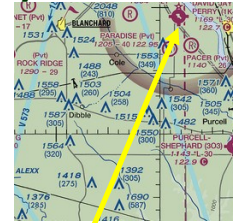
David J. J. Perry Airport (1K4)