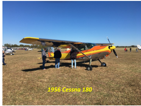
1956 Cessna 180