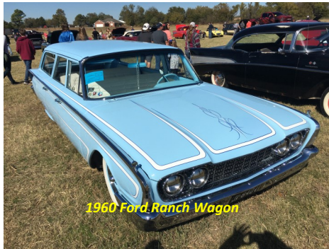
1960 Ford Ranch Wagon