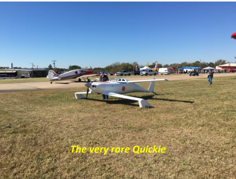
The very rare Quikie