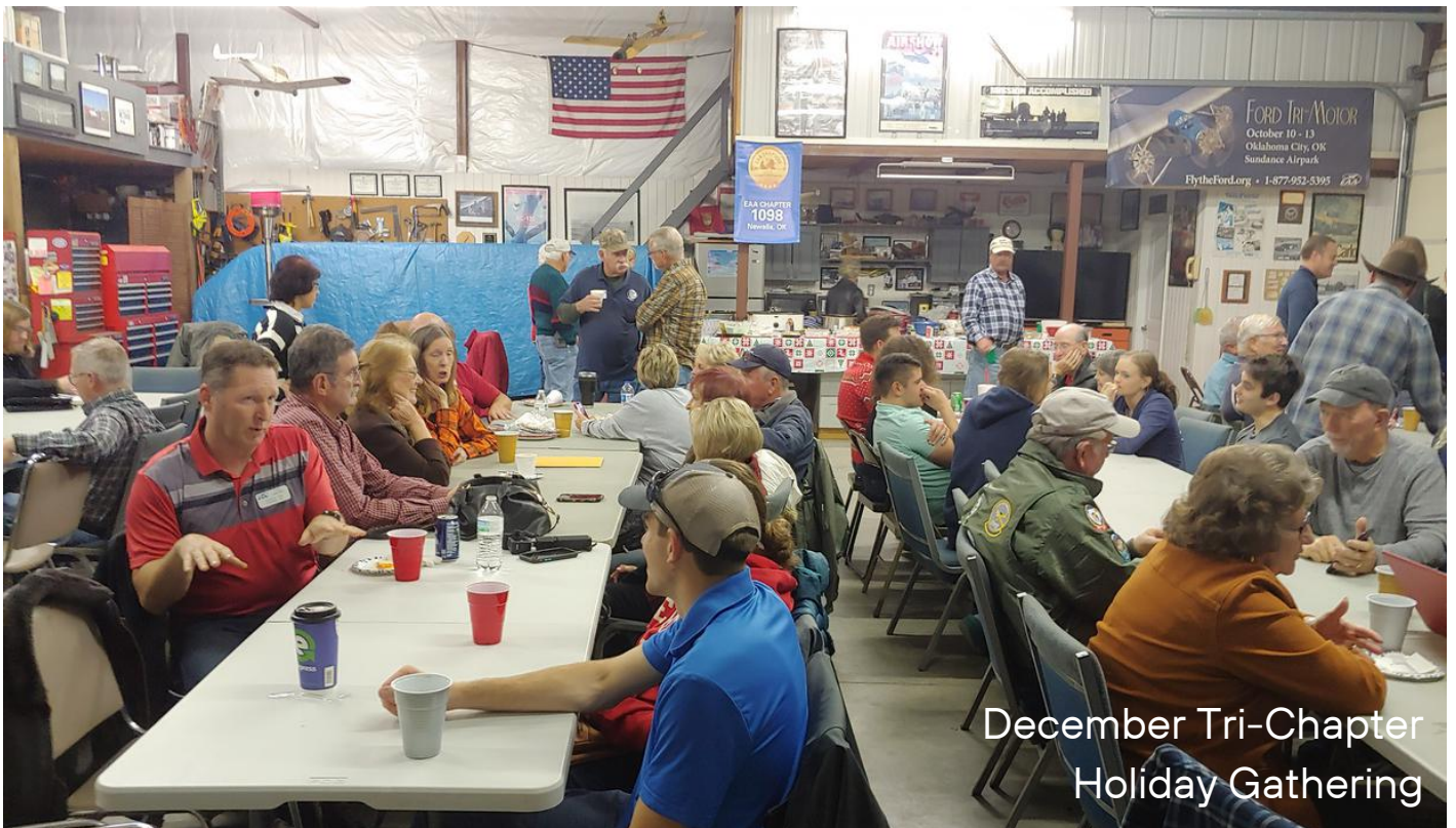
December Tri-Chapter Holiday Gathering