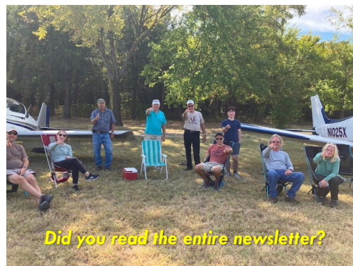
Did you read the entire newsletter?