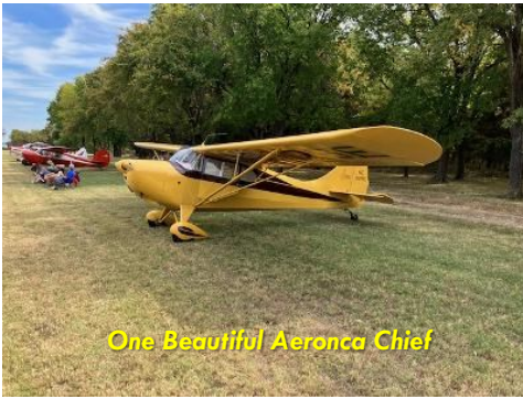
One Beautiful Aeronca Chief