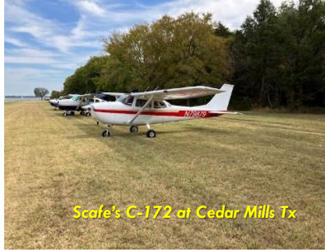
Scafe's C-172 at Cedar Mills Tx