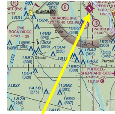
David J. Perry Airport (1K4)