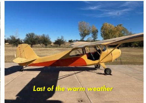
Last of the warm weather