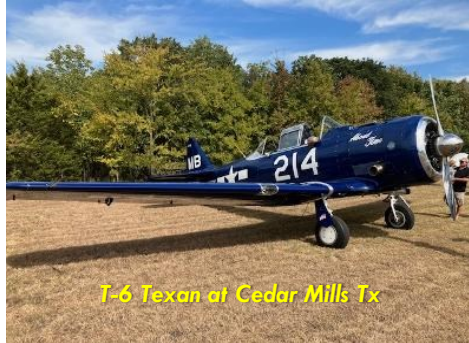
T-6 Texan at Cedar Mills Tx