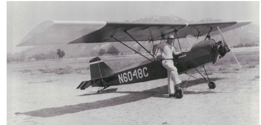
Here is the December 2022 "What is it?"

The initial plan was to produce several models with different powerplant options, including a two-stroke powered ultralight, a high-powered racing model and an electric model. The company has more recently announced that only the electric model will be produced, citing that "it's quiet, efficient, eco-friendly and it's easy to maintain". The aircraft wing can be removed for storage or ground transportation. I saw this at the Aero 2011 show in Friedrichshafen Germany.