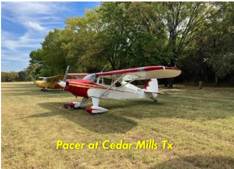
Pacer at Cedar Mills Tx