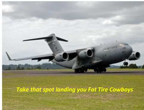
Take that spot landing you Fat Tire Cowboys

weather owes us a break. Those who plan to participate need to be on site by 9:00 am for a pilots' briefing. We'll discuss the rules and draw straws to determine the order of flight. Plan to begin the event by 9:30 and finish when everyone has had their chance to impress us. We'll also need a few folks on the ground to