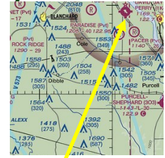
David J. J. Perry Airport (1K4)