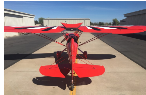
Here is the September 21 "What is it?"

the Travelight. A second model was constructed, built for pilots up to 6' 2", which became known as the Mico Mong. The fuselage is welded 4130 steel tubing. The front wing spars are 2.5 in aluminum tubing, with aluminum ribs and aircraft fabric covering. If equipped with a Rotax 277 engine, the aircraft meets American FAR 103 Ultralight Vehicle standards by weighing less than 254 lbs. The wing area of the ultralight version is larger than the heavier Mong Sport it replicates, in order to keep the stall speed low.