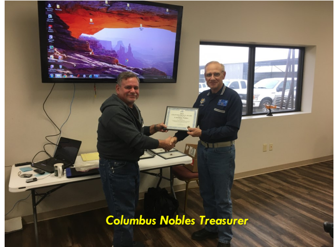
Columbus Nobles Treasurer