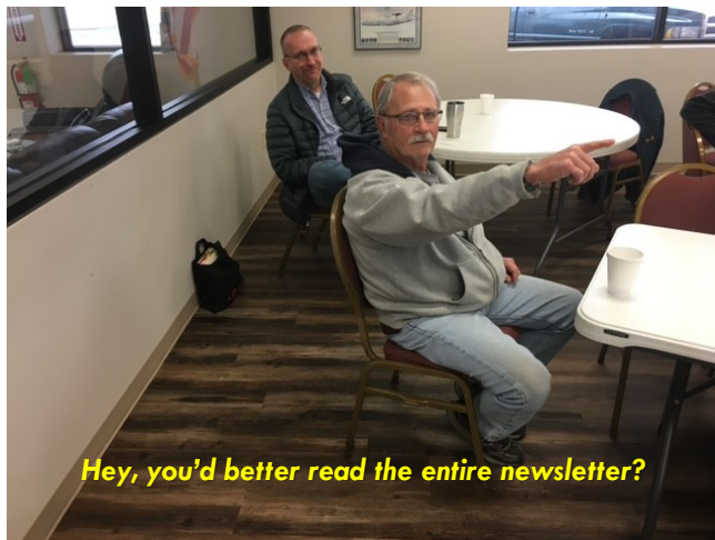
Hey, you'd better read the entire newsletter?