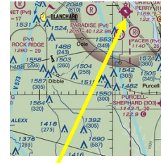
David J. Perry Airport (1K4)