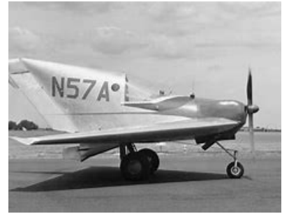
Here is the October 2022 "What is it?"