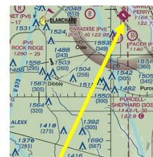
David J. Perry Airport (1K4)