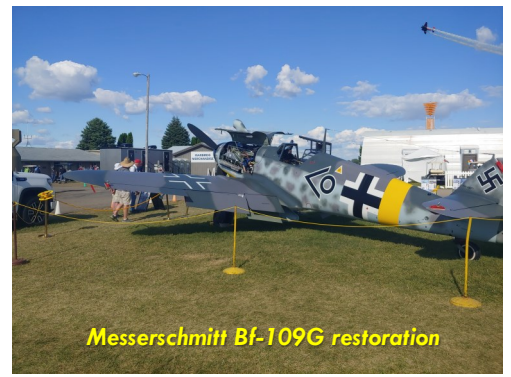
Messerschmitt Bf-109G restoration