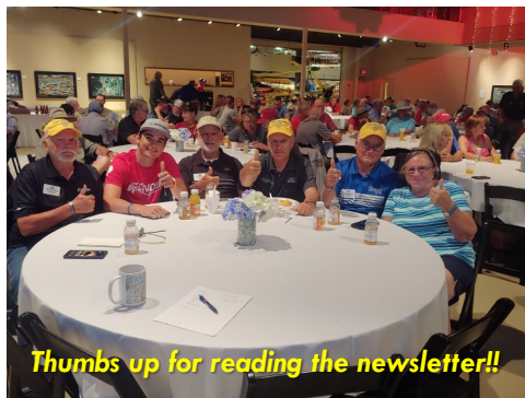
Thumbs up for reading the newsletter!!