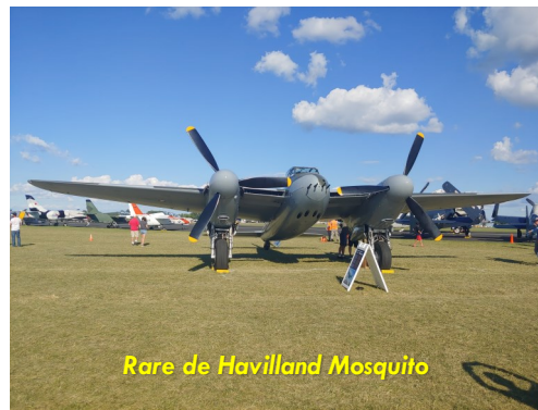
Rare de Havilland Mosquito