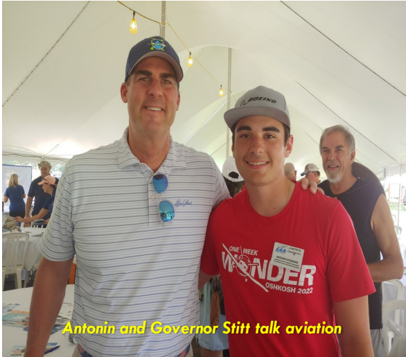
Antonin and Governor Stitt talk aviation