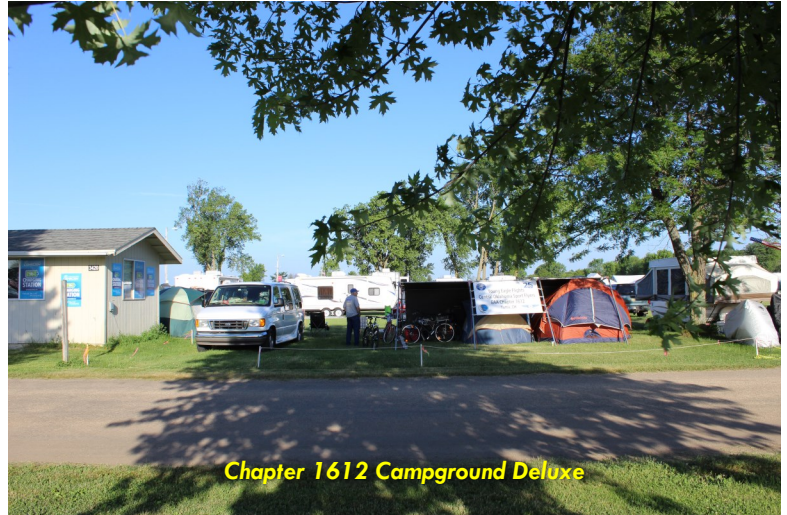
Chapter 1612 Campground Deluxe