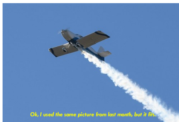
Ok, I used the same picture from last month, but it fits.

You are flying between the David J. Perry and Chickasha airports at 3,000' MSL when you here a loud bang, engine begins to run extremely rough, and oil starts to cover the windshield. What do you do? Don't be fooled, there are a lot of steps to this emergency.