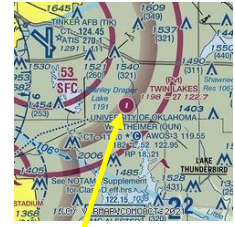
Twin Lakes Airport (20K2)