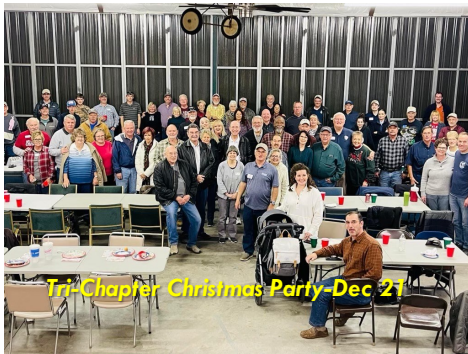
Tri-Chapter Christmas Party-Dec 21