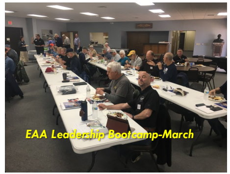
EAA Leadership Bootcamp-March