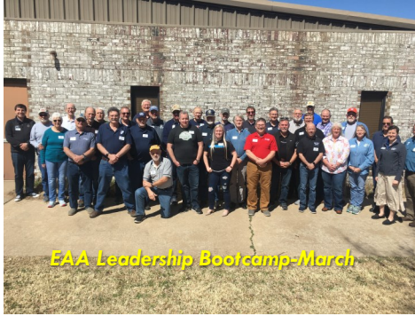
EAA Leadership Bootcamp-March