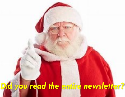
Did you read the entire newsletter?