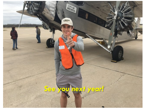
See you next year!