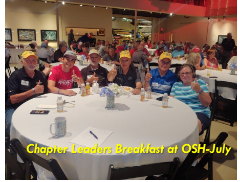
Chapter Leaders Breakfast at OSH-July