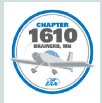
Kent Nordell and YE's