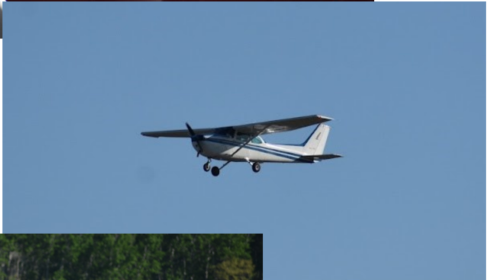
Trudi and YE Crew enjoying that great weather!!!