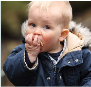
“Now THAT’S a brat!”