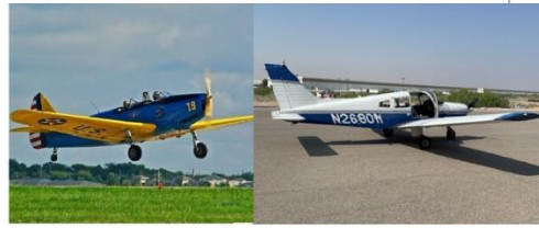
Then Trainers Now