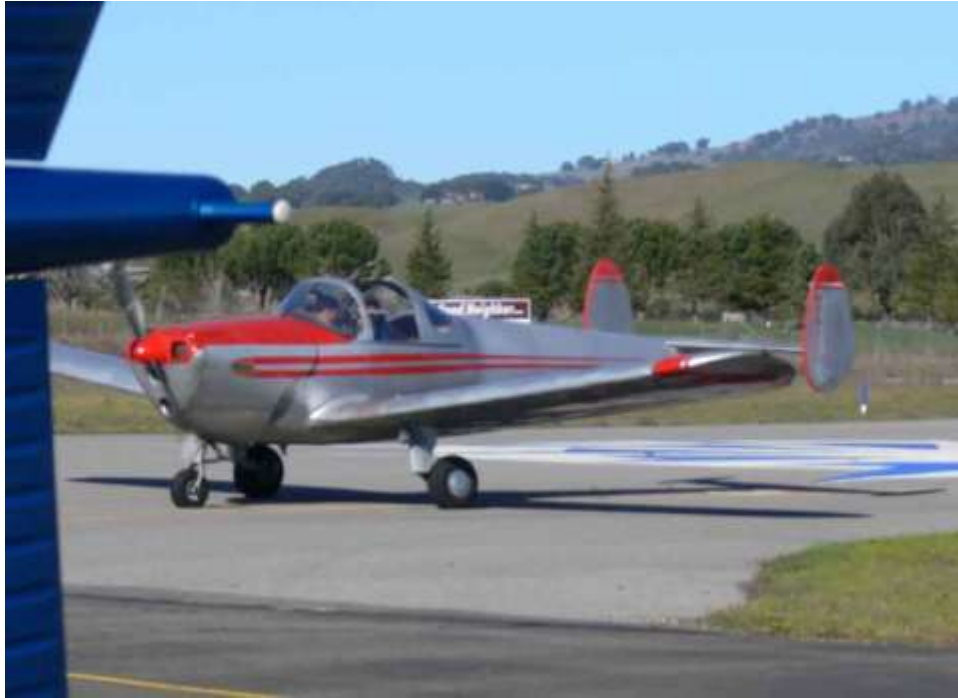
Surprise again! Jim's plane taxiing