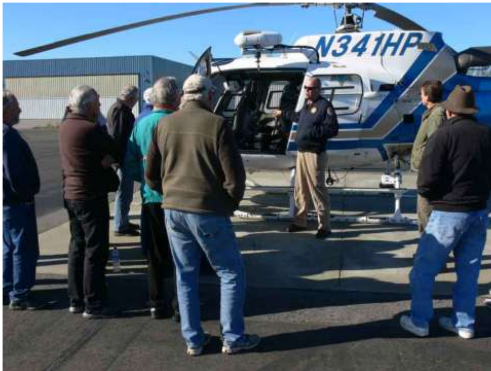
CHP showing off their copter

The following pics where all taken during our plane inspection