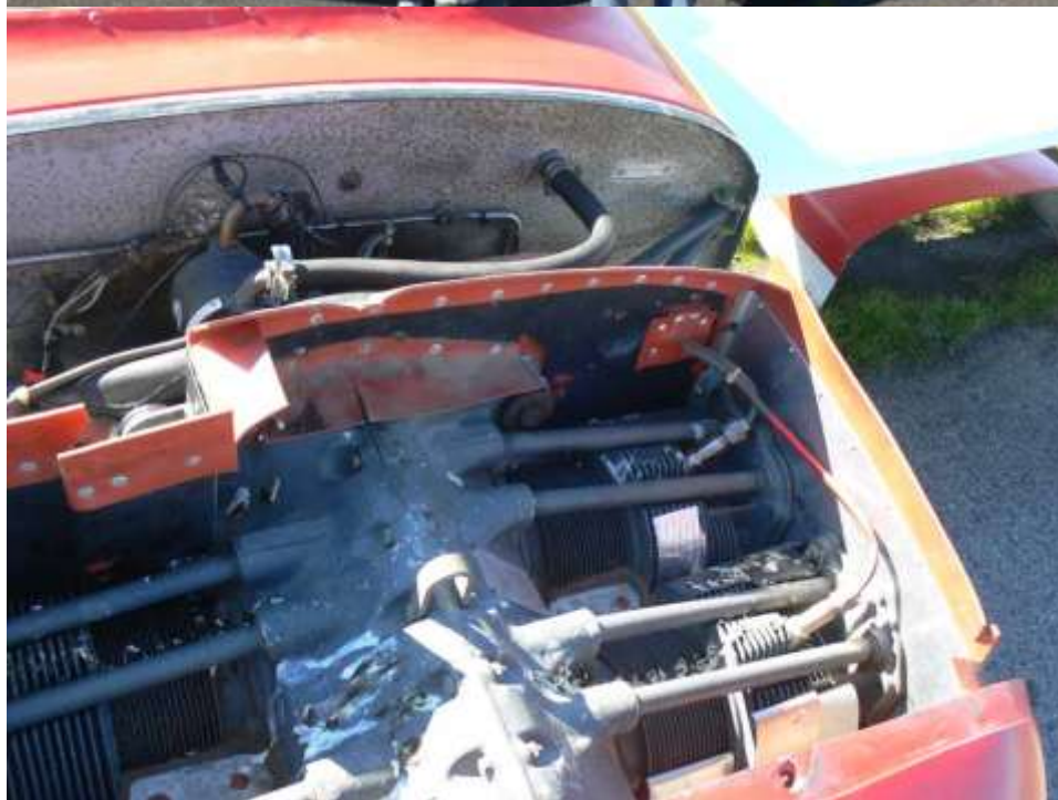
Surprise! Bird dung on Luke's engine (end of inspection pics)