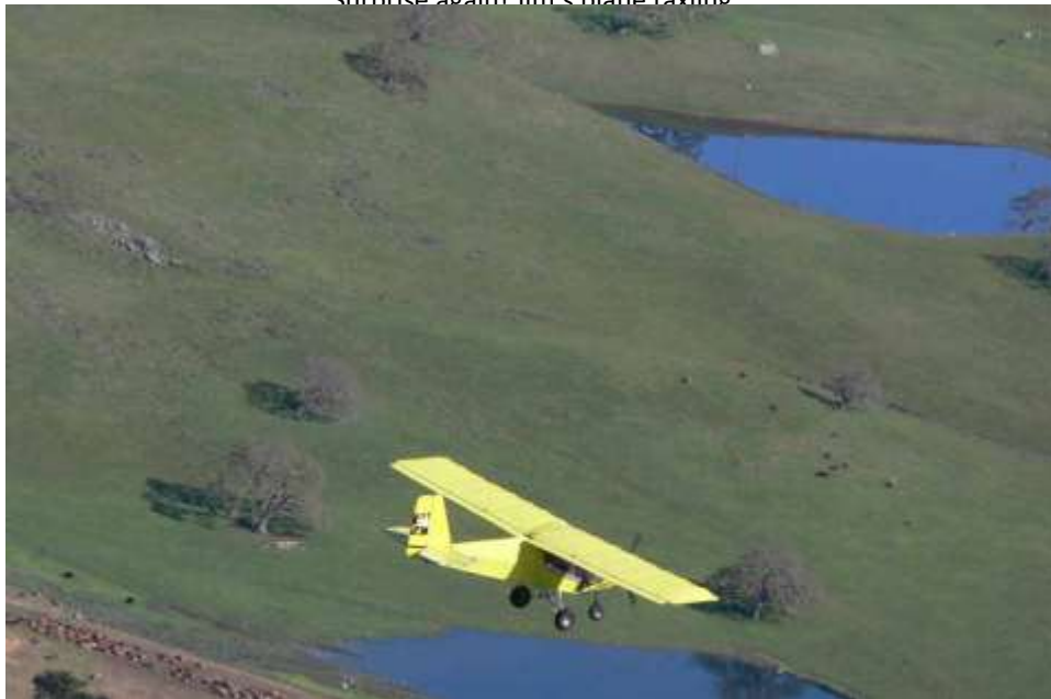
Surprise, Mark's plane still flies!