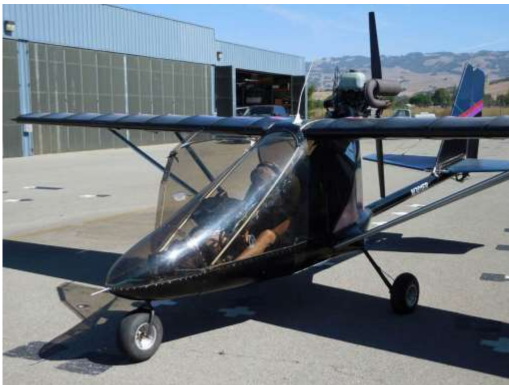
Taxiing out for first flight (He got about 5' up)