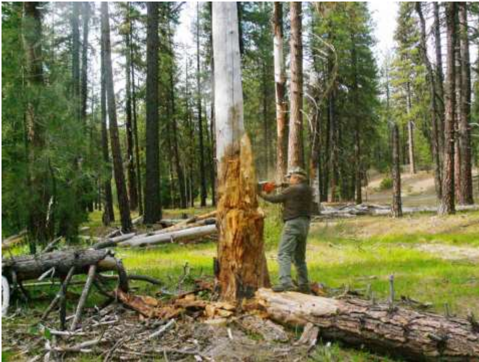
Tree cutting near Hayfork to get a little wood for a small fire.