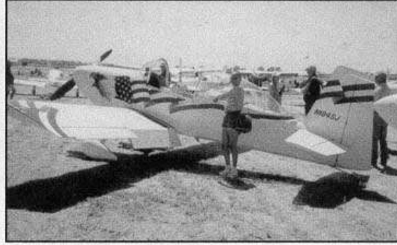
A spiffy 2 seater. Does anyone know what model it is?