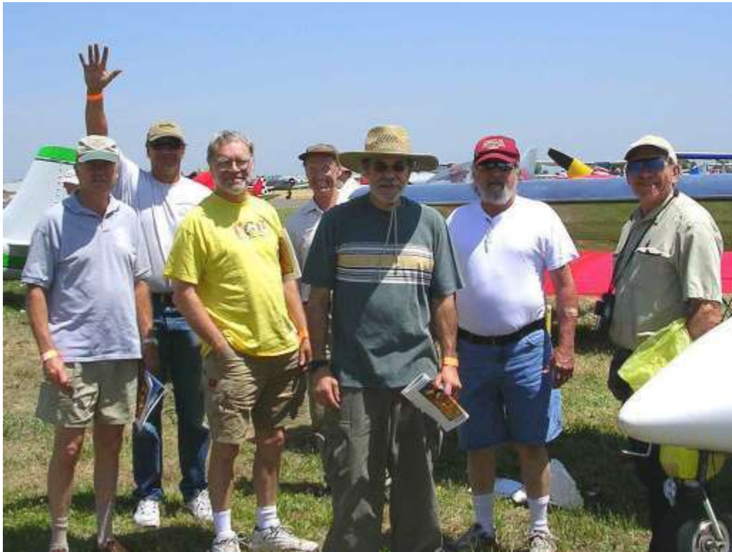
Some of the Guys who came to Marysville