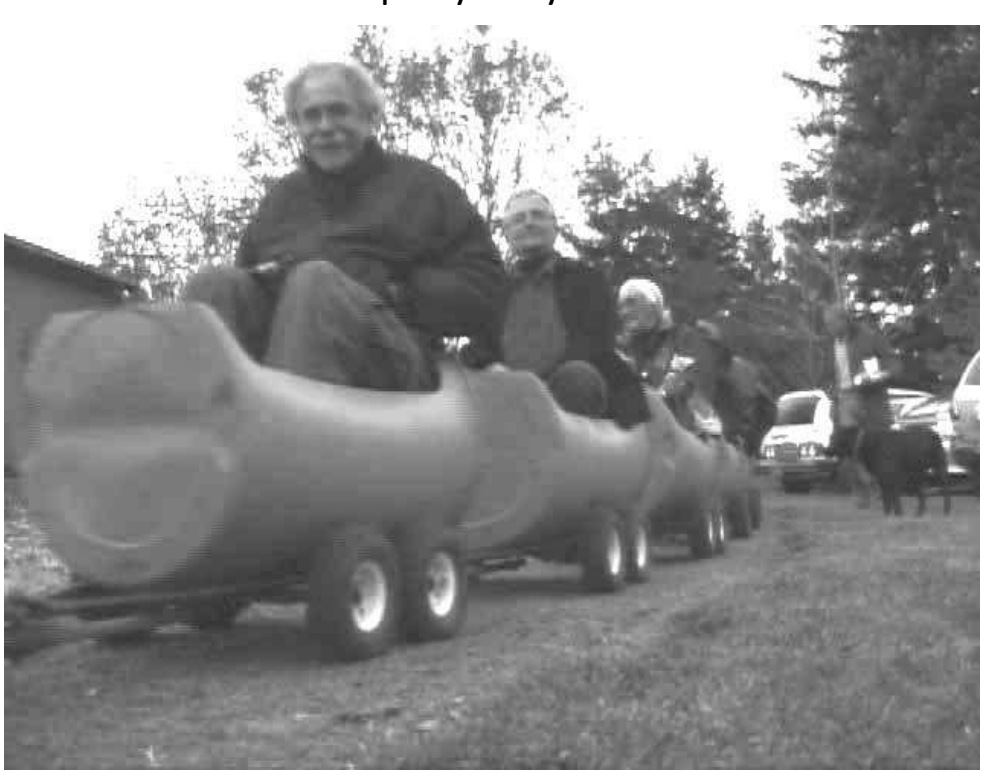
Les is certainly enjoying the ride! As is everyone!