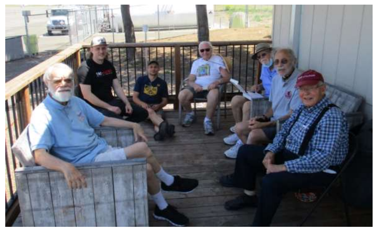
At last month's get together at the Petaluma office