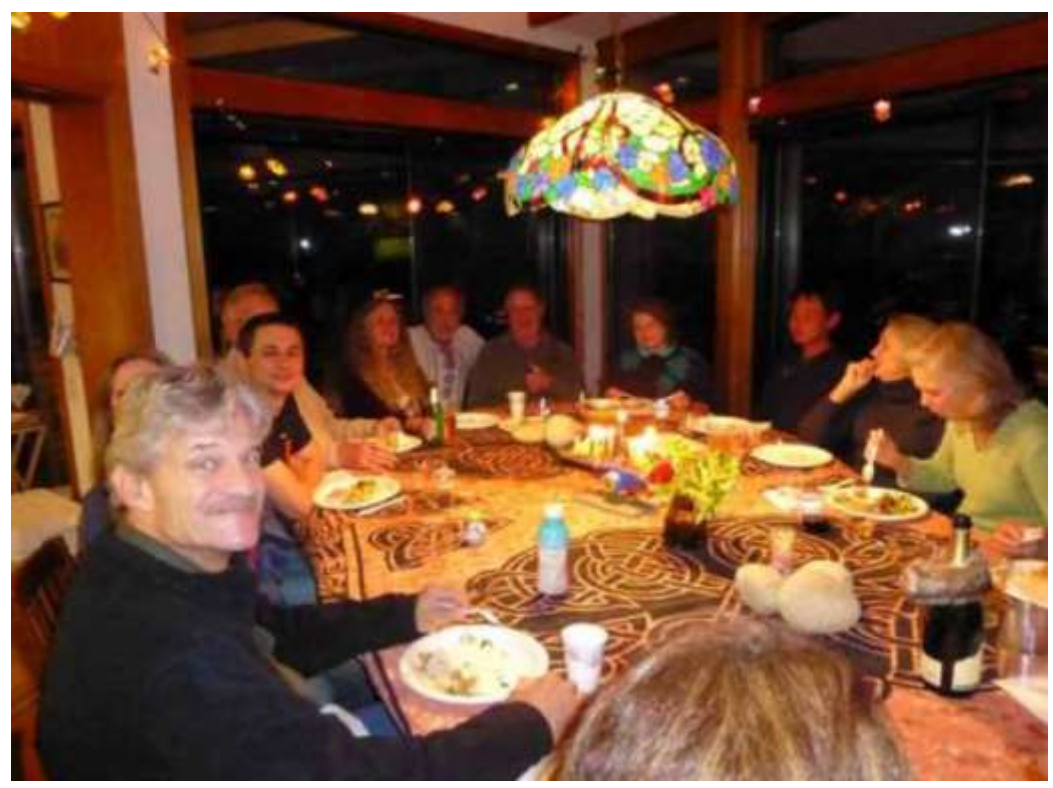
Six years later here we all are again at Les's house