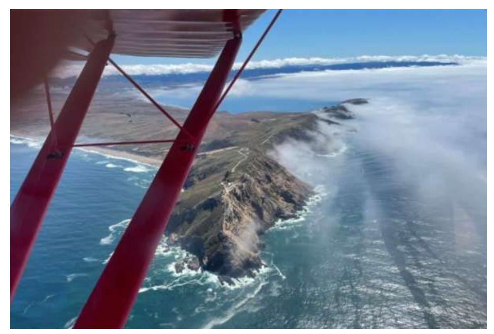
Pt Reyes, from Bill's prospective