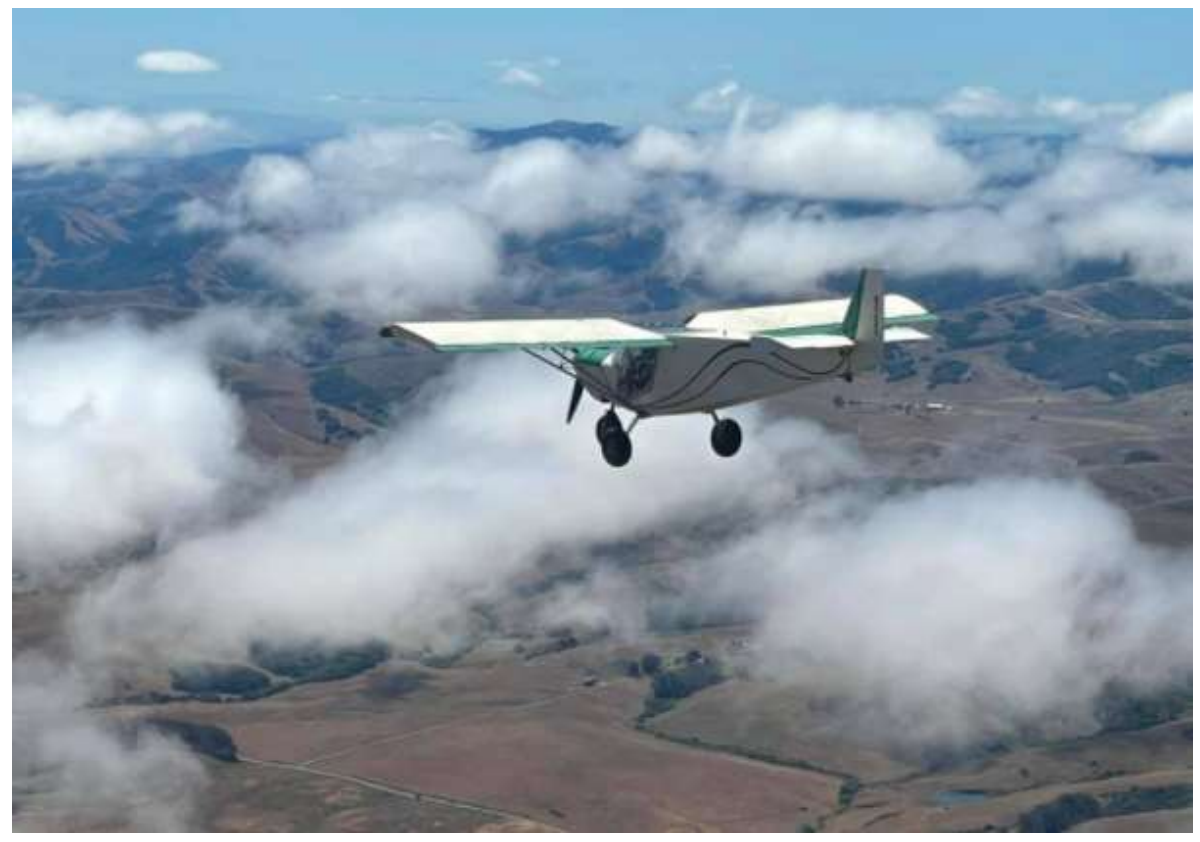
Bill took this pic as while Les was outpacing him. To paraphrase a song, "Clouds got in our way"