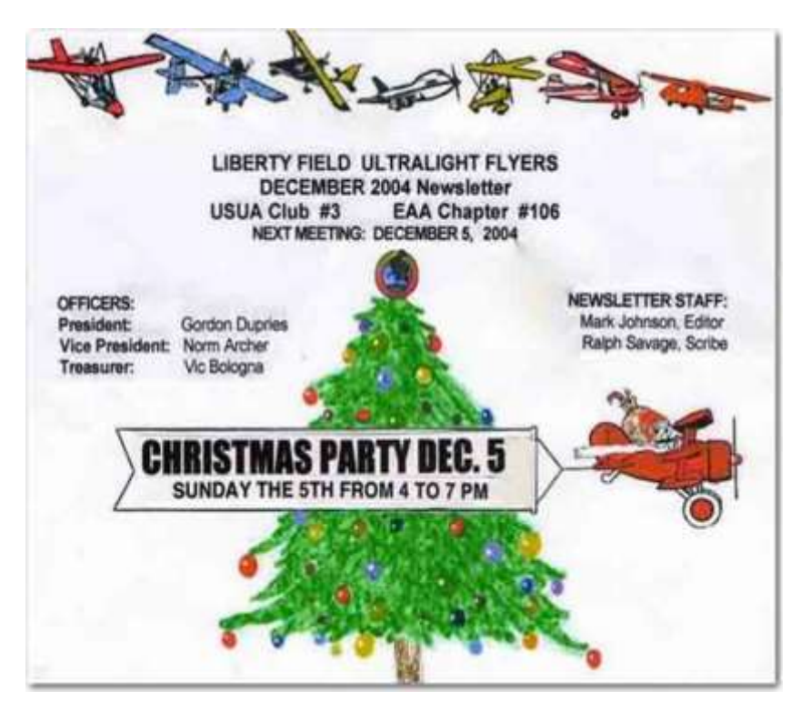
Our very first full-color Christmas announcement