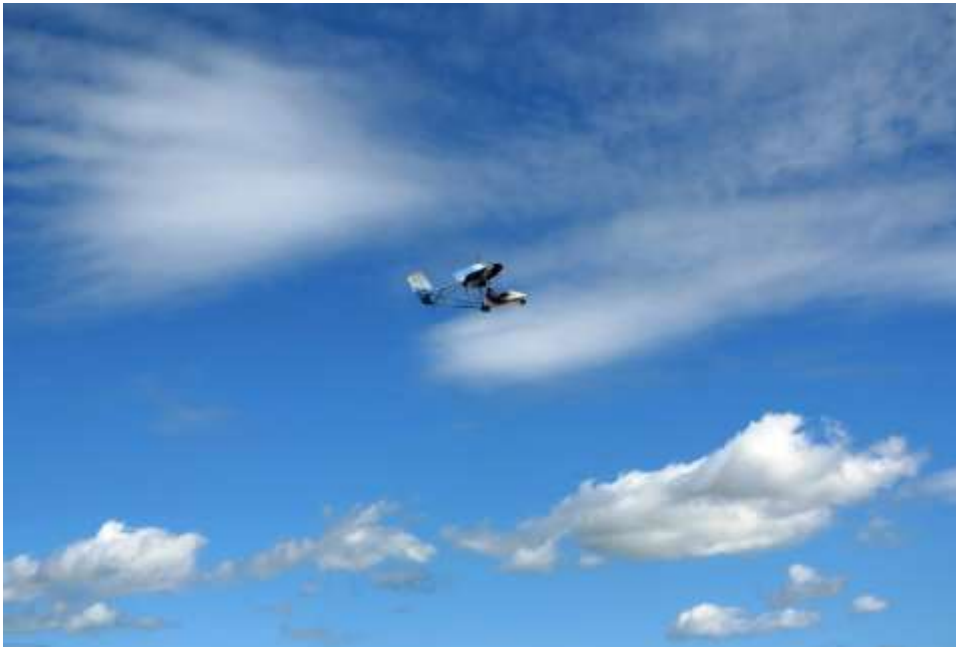
Chris submitted the following pics