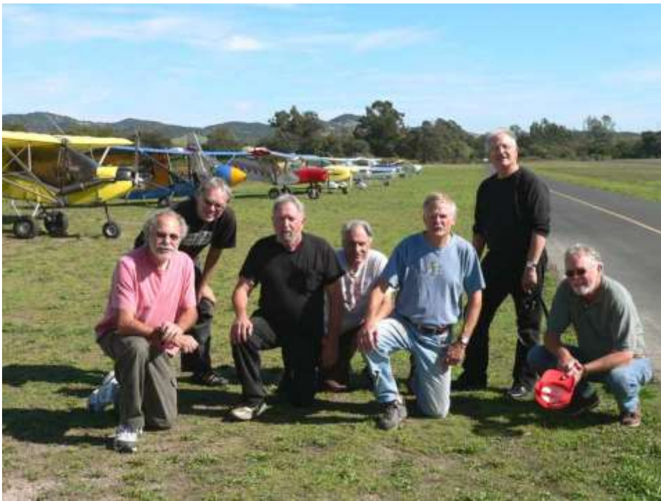
The guys at SkyPark (circa 2006??).