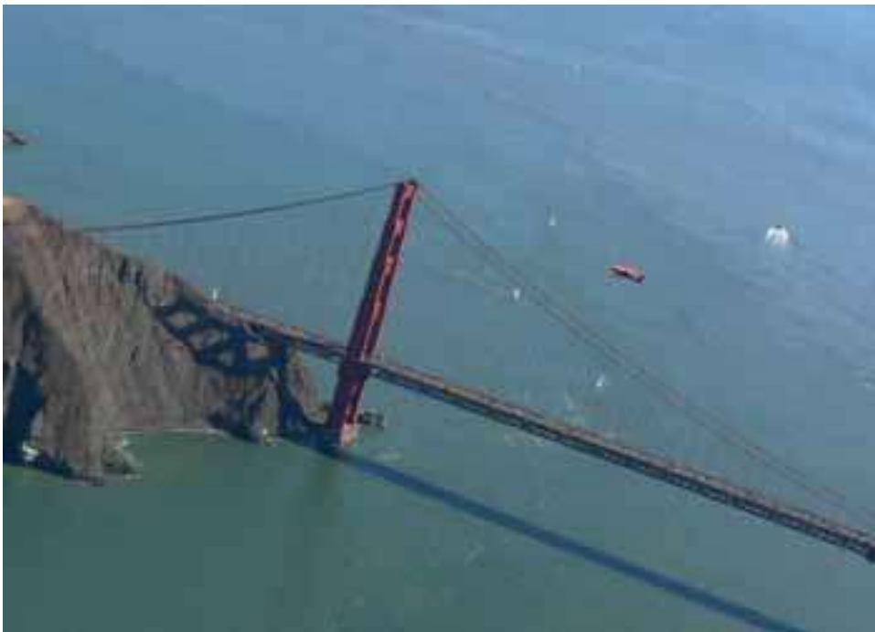
Bill, not trying to hit the bridge here