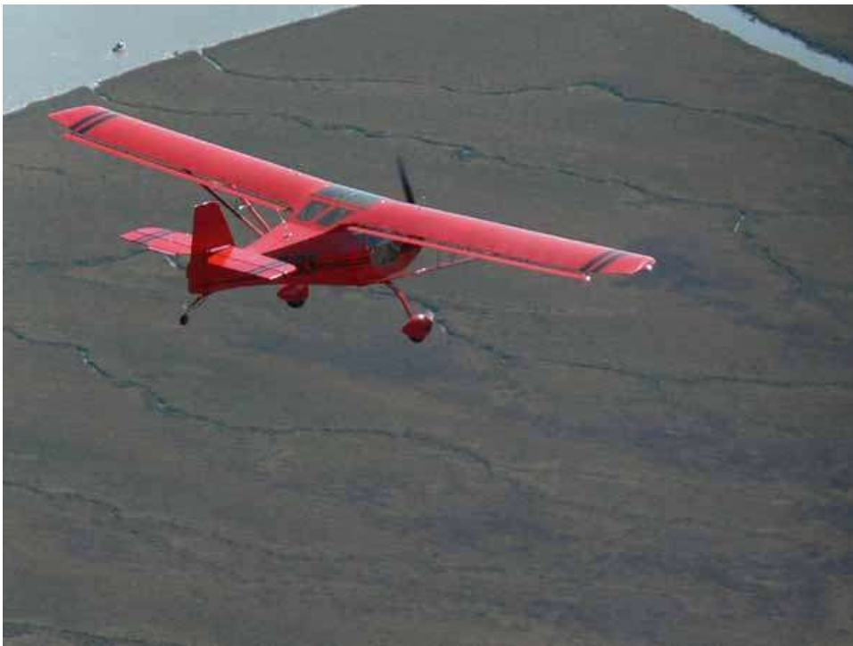
Bill on way to GG Bridge