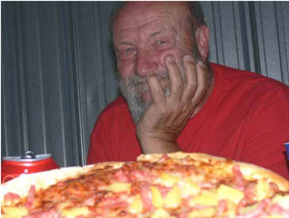
Bim in contemplation