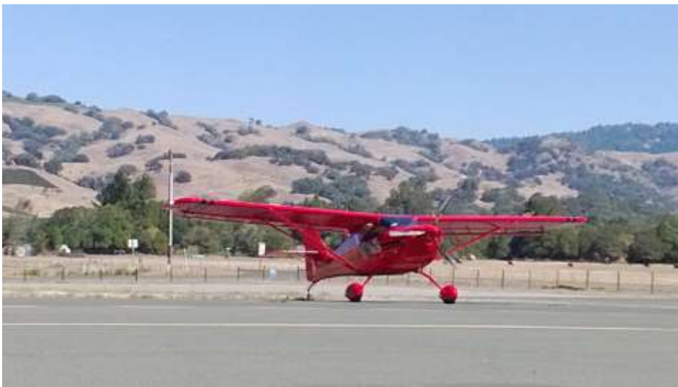
Chris says Bill's plane was at Pillsbury in 2013, but this looks more like Boonville.