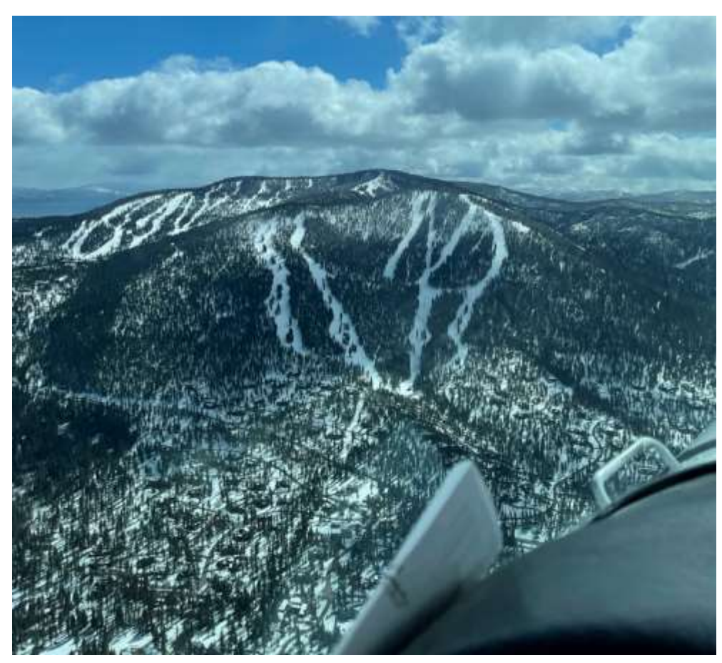
Damien flying near Heavenly at lake Tahoe