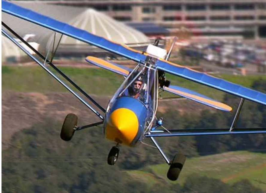
A great plane to own (note camera mounted left side of cockpit).

Extras include: Grand Rapids Electronic EIS (Engine Instrument System), 1150# BRS chute, fiberglass main gear with tundra tires, hydraulic breaks, hinged easy-access nose cone, upholstered seat, Hacman mixture control altitude compensation (tested at 11,000+-feet), auxiliary fuel pump, full cover (never used), spring dampened nose gear, belly bag in-flight storage, Superflite paint, and more.