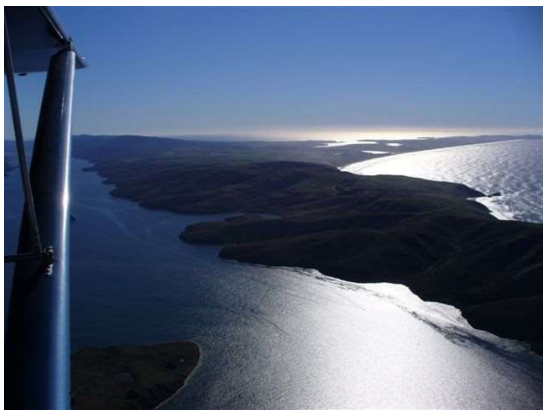
Looking South from Tamales Pt. toward Pt Reyes last week