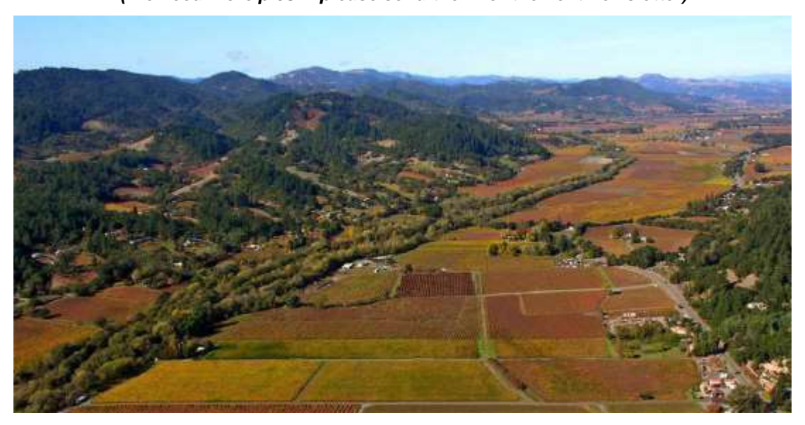
Bim's pic of Sonoma vineyards The rest of the pics come from Les's resent flights