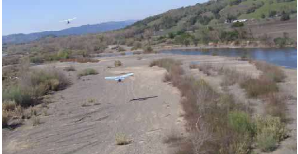
Flying high over the Russian River