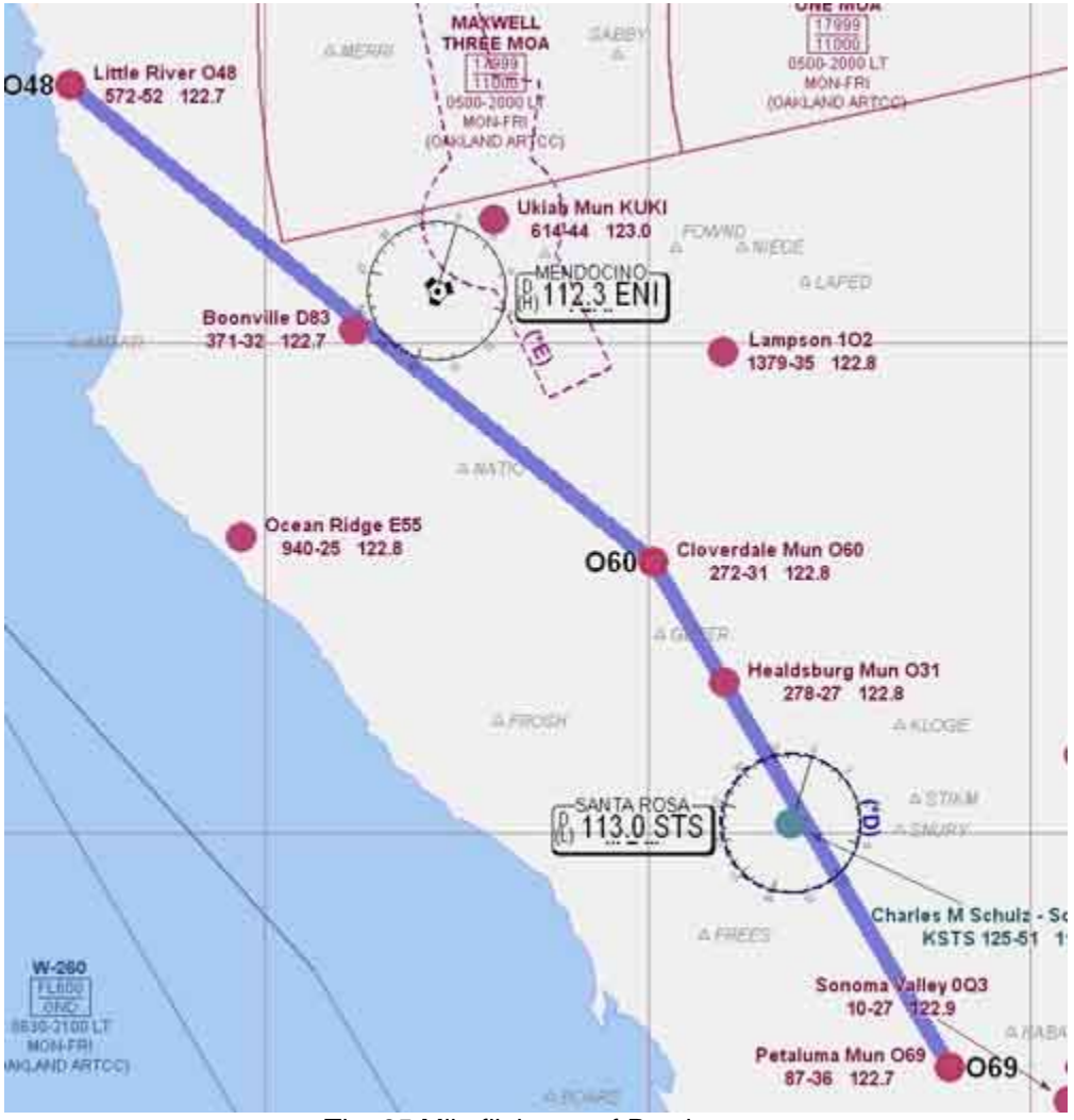
The 95 Mile flight out of Petaluma

At Little River we will be able to get gas and take a cab into the historic town for lunch. We plan to leave Little River at 1:00PM so that we will be back in Petaluma well before our 4:30-PM monthly meeting.