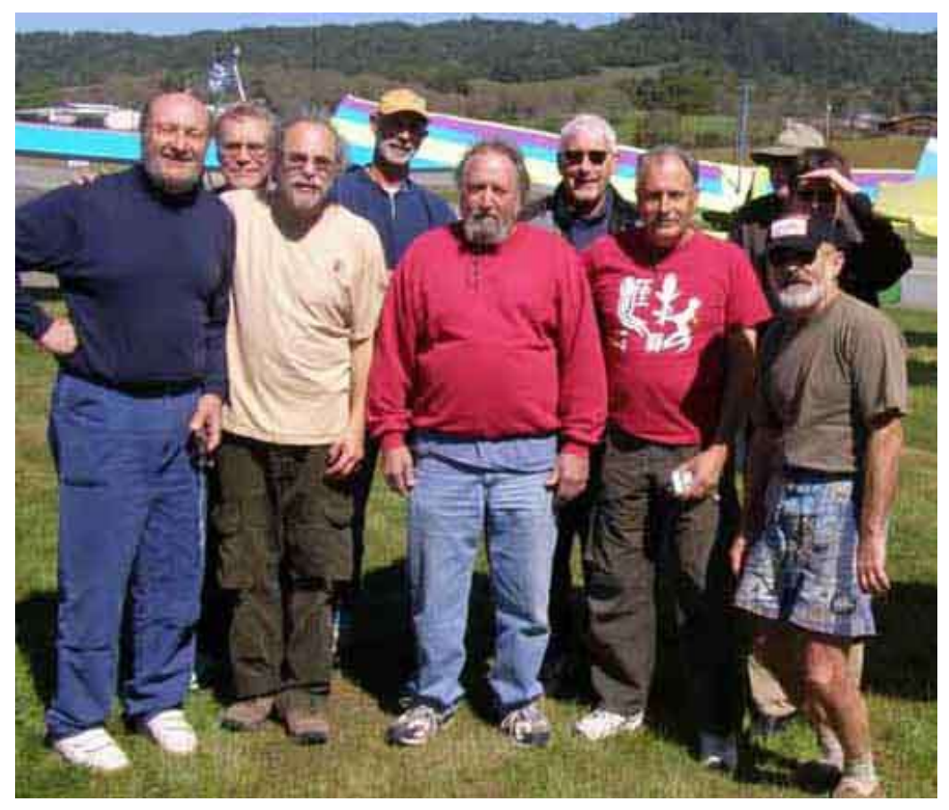
The gathering just prior to being fed by Bim