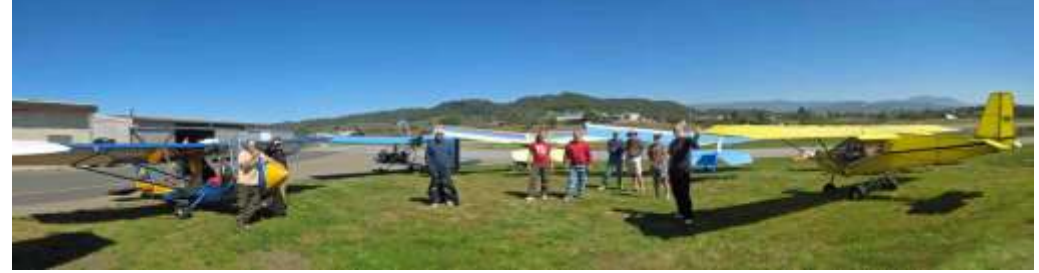
Bim's great pieced-together 270-degree panoramic shot