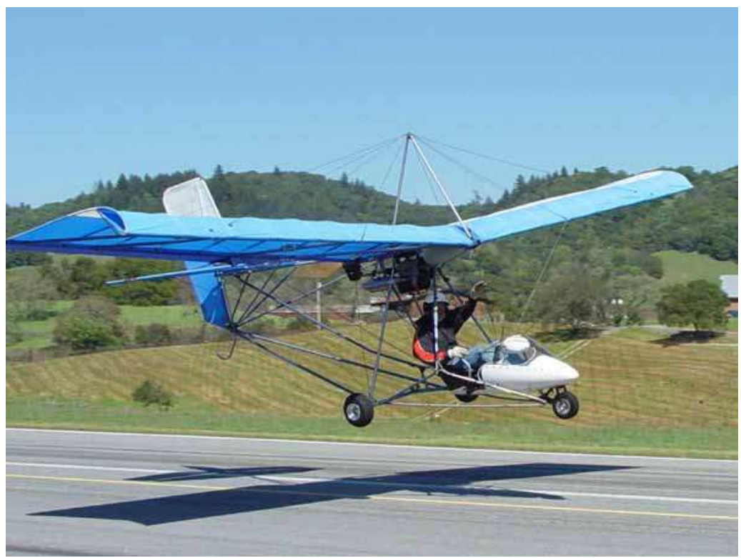
Lynn saying goodbye and heading into the wild blue.