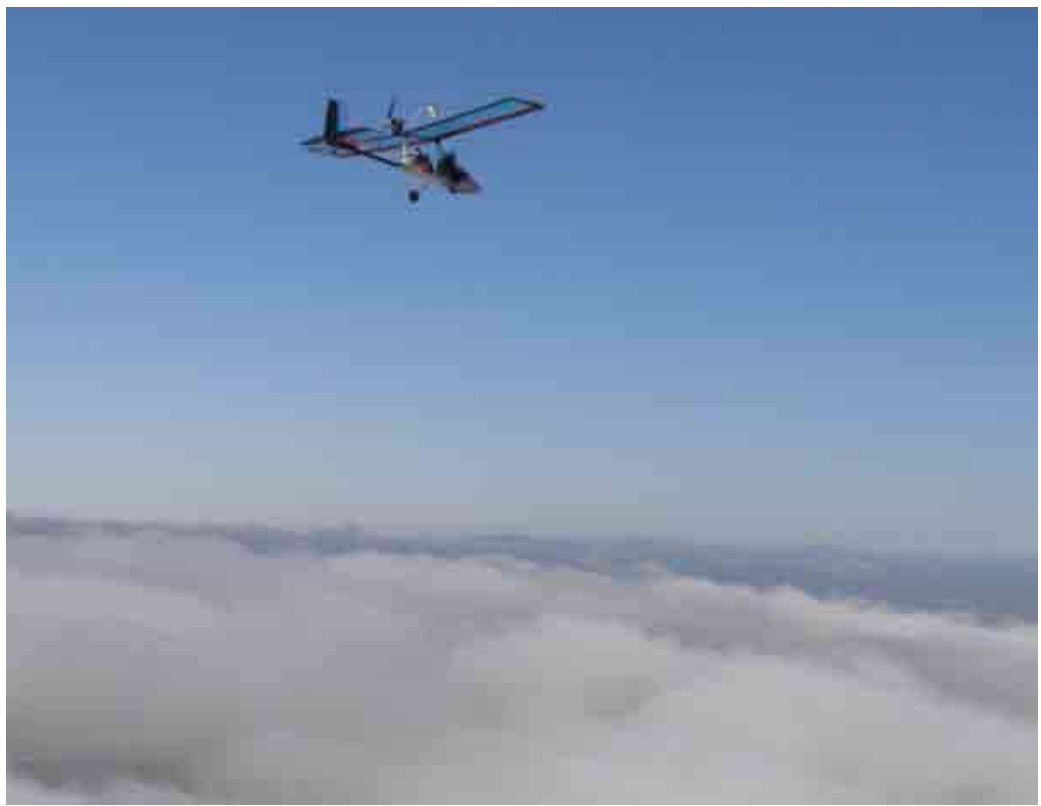
Charlie over the fog (is this allowed?)