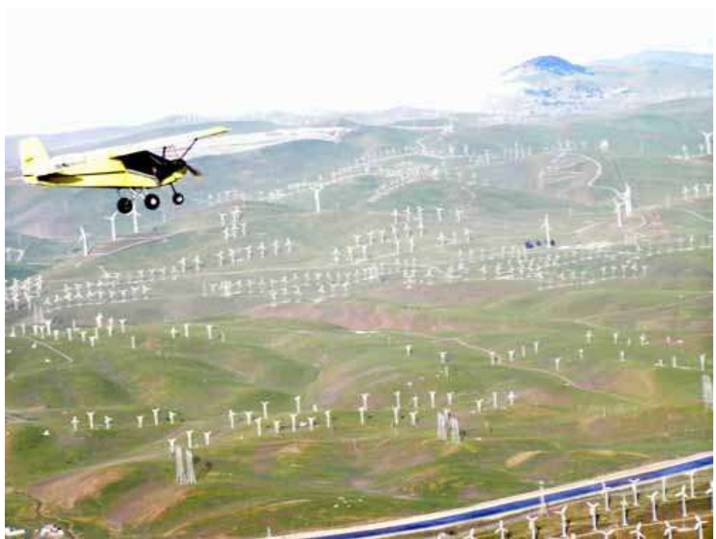
On the way home, Mark doing windmills (they were going 4500+ rpm)