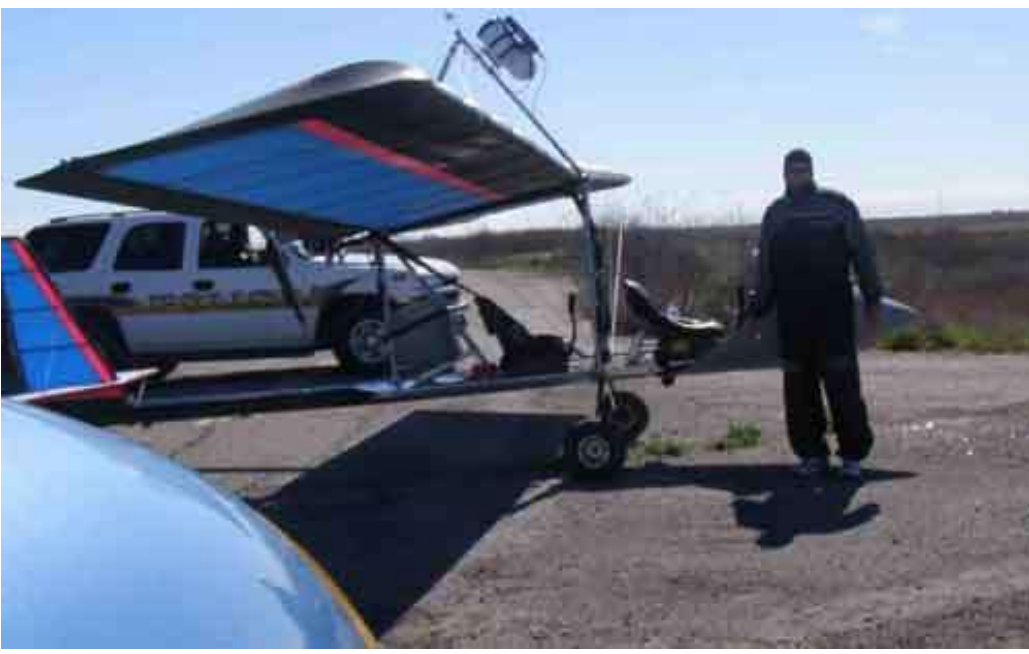
Charlie running from the Security force while Les took off (chicken)