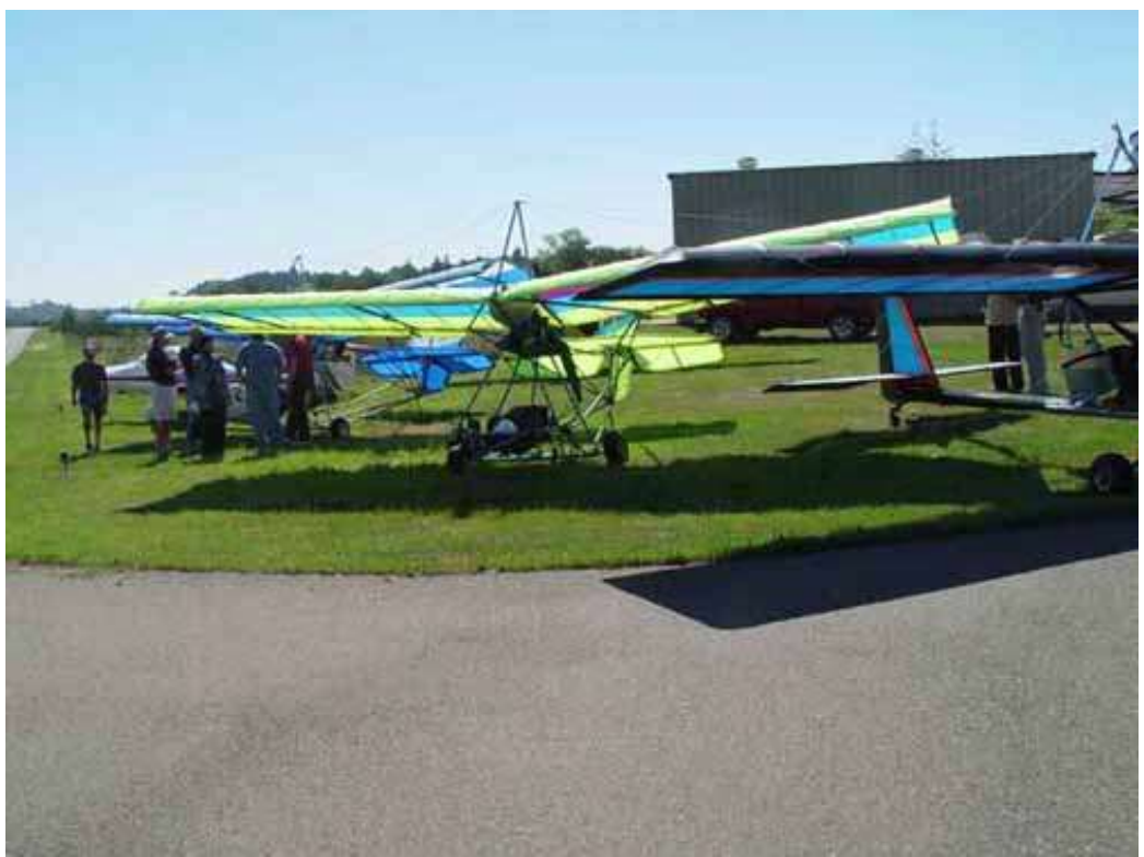
A gaggle of ULs outside Bim's hanger