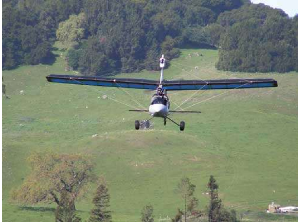
Charlie playing chicken (taken with a telephoto lenses)