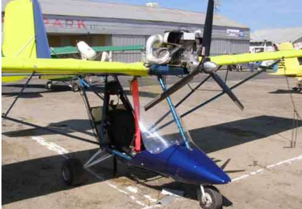
What we came to see... Andre Mirek's new plane (we didn't get a flying demo)

The group at Turlock included some new members, three from Lodi, and locals