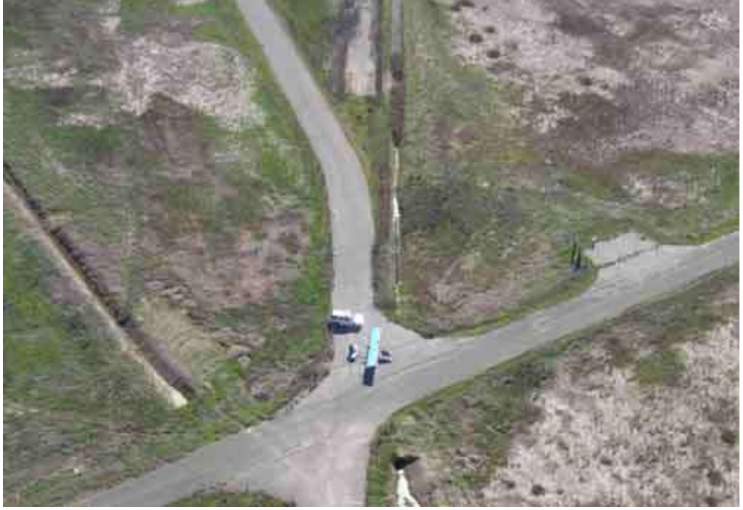
Charlie on the ground with the cops (his road is on the top of pic)