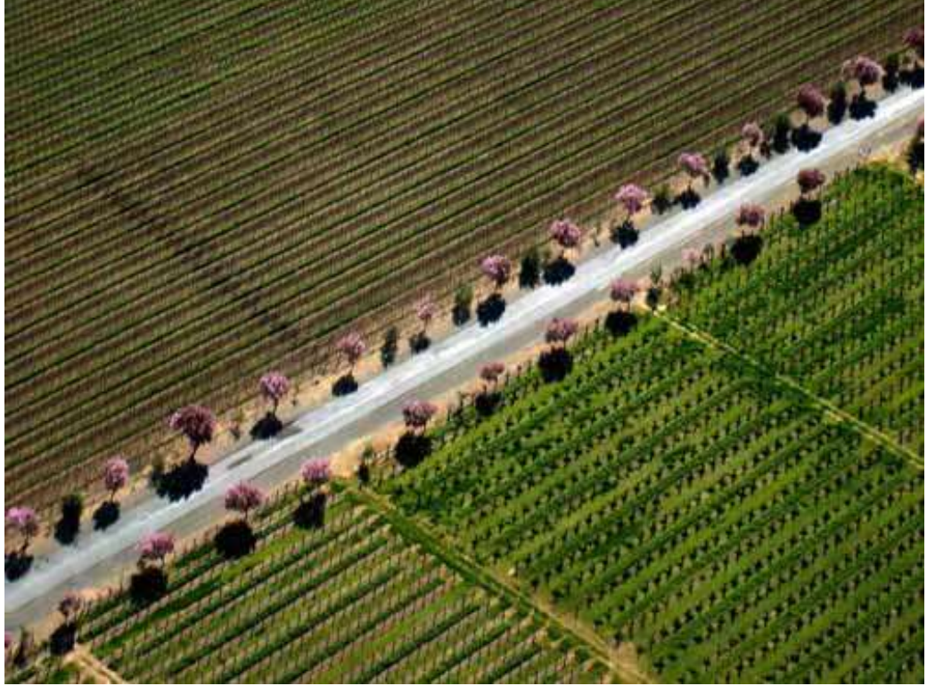
Bim's picture of an ideal landing spot