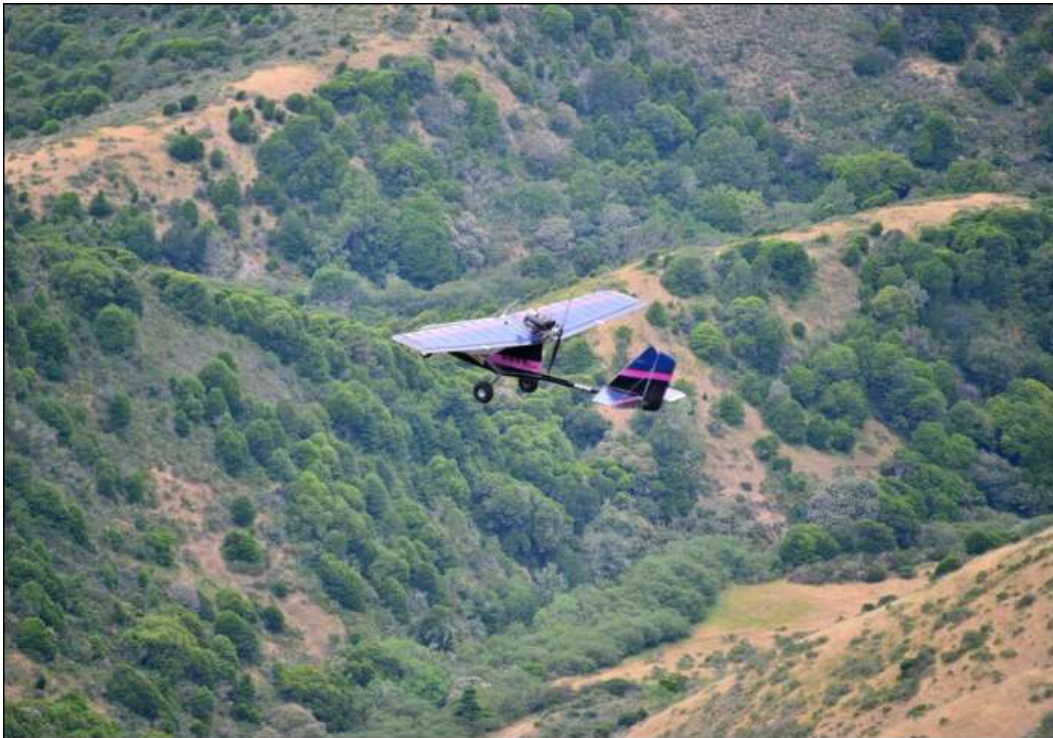
Local flight Saturday