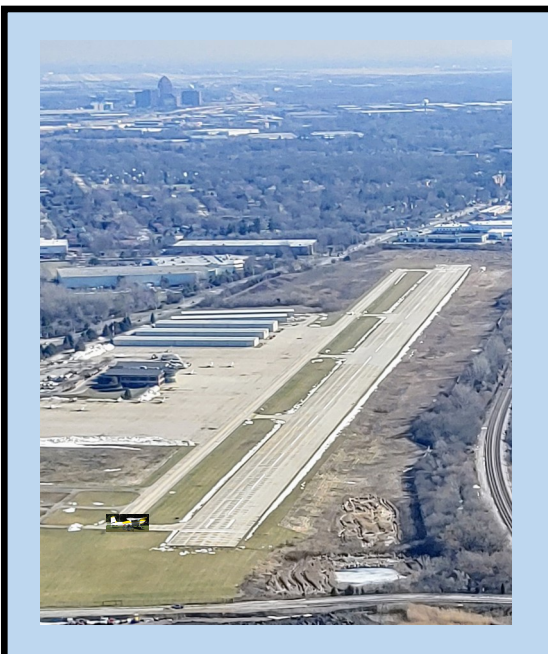
Schaumburg Regional Airport 905 W Irving Park Road Schaumburg, IL 60193