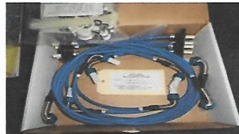
New Horizons Maggie Aircraft Ignition ...