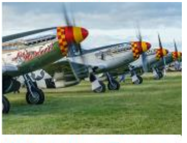
Warbirds in Review