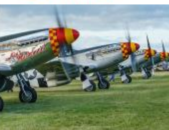
Warbirds in Review