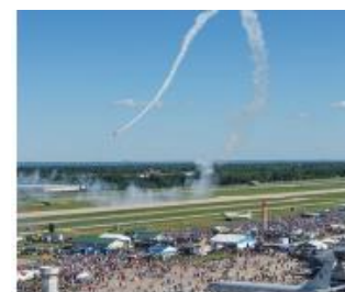
Live Air Show