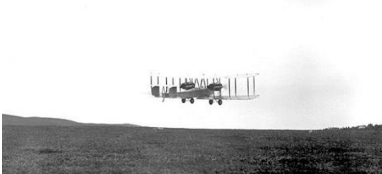
(After 16 hours, a 'soft' landing in Ireland)