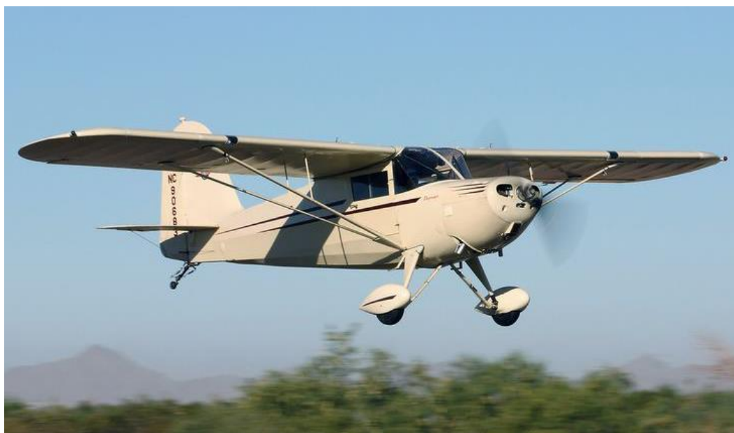
(File photo of a nicely restored Commonwealth Skyraider)

Bill Verduin (616) 403-1666 or Gary VanFarowe (616) 795-5650