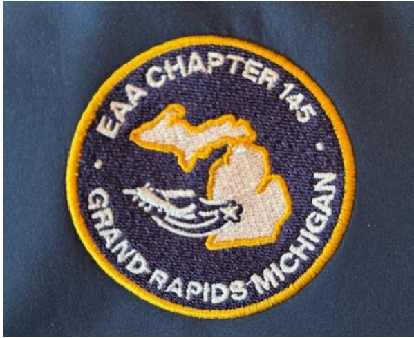
The newly designed Chapter 145 logo.