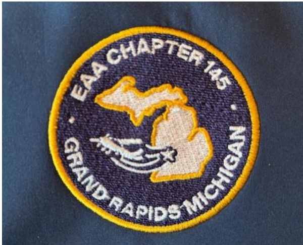
The newly designed Chapter 145 logo.