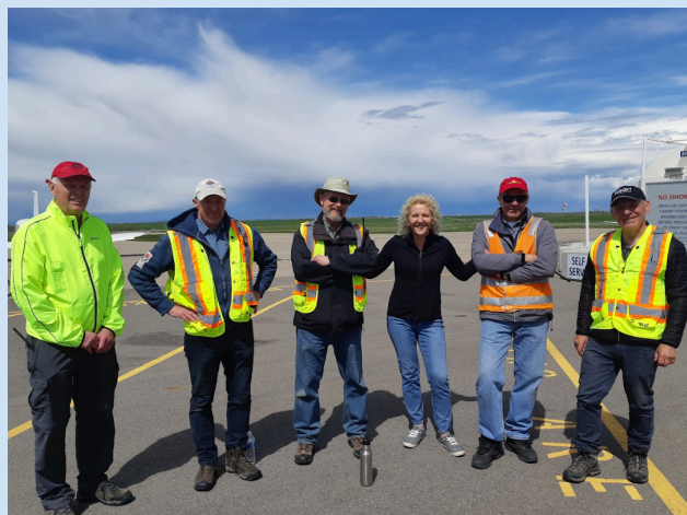
Chapter 1410 Ground Crew Alberta Air Tour