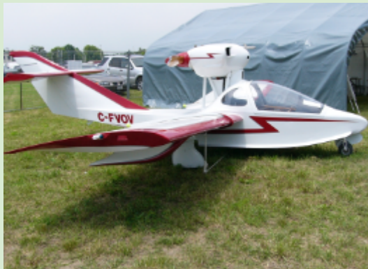
(Representative photo of finished aircraft from Wikipedia)

Engine package is from another Osprey and includes engine mount, propeller, cowling and O320 with 67 hours in the logbook. New exhaust system required.