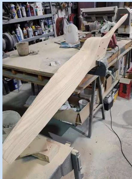
Jack's latest Propeller build

We look forward to these upcoming presentations, and to see the continuing and varied projects undertaken by the Chapter 1410 Build group aka Jack's Rivet Renegades