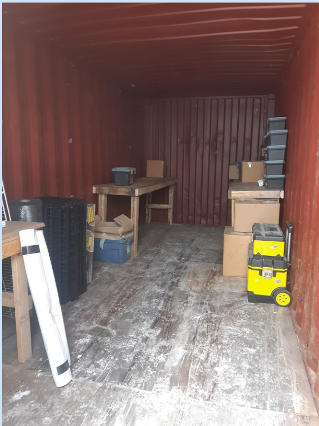
EAA Chapter 1410 Tool Crib located at Steve Hurst' Farm

For Tool Crib requests or inquiries contact Steve Hurst sjsteve1@hotmail.com