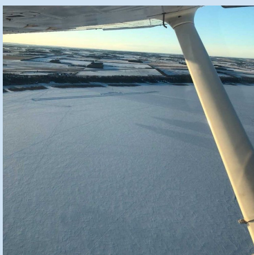
Gull Lake Ice Strip

CEX3 Wetaskiwin AB Coffee 9:00 to 12:00 fourth Saturday each month. Feb 24