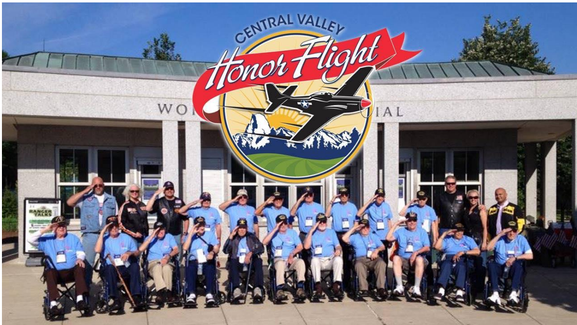
Central Valley Honor Flight