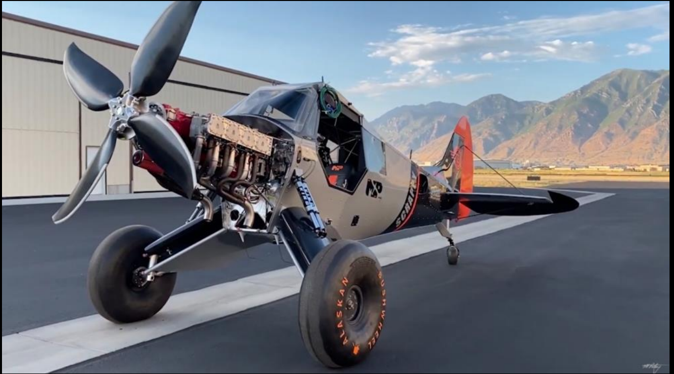
Photo Of The Week For November 2, 2020 —Scrappy's Insanely Powerful Engine