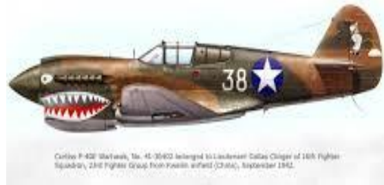
Curtiss P-40E Warhawk

Of the 13,738 P-40s built, only 28 remain airworthy, with three of them being converted to dual-controls/dual-seat configuration. Approximately 13 aircraft are on static display and another 36 airframes are under restoration for either display or flight