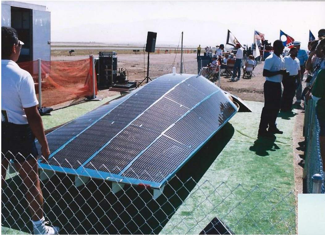
Air Show at EAA 14: Solar Car Display