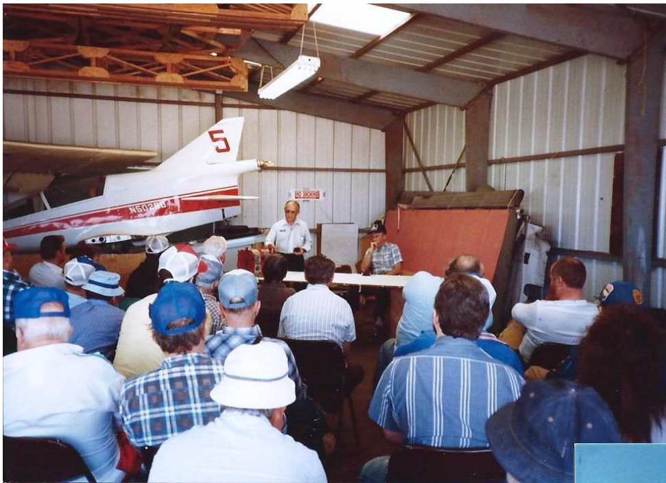
Air Show at EAA 14: Wankle Forum