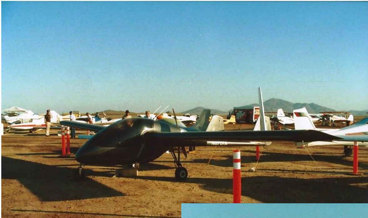
Air Show at EAA 14: Starduster