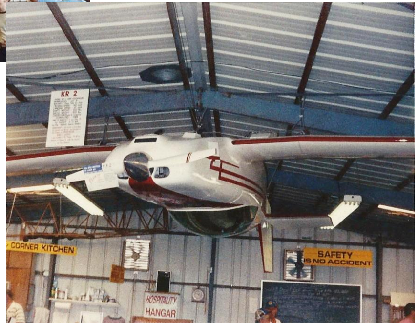
KR-2 hanging from rafters