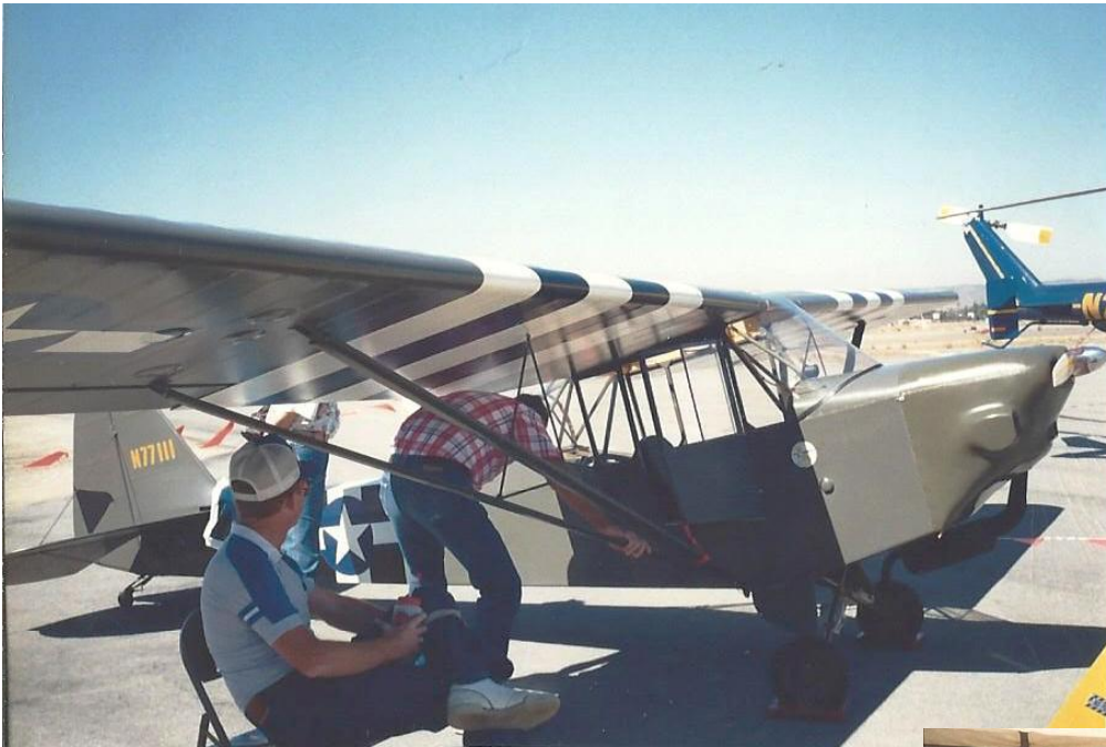
Gillespie Aviation Day: LP-2