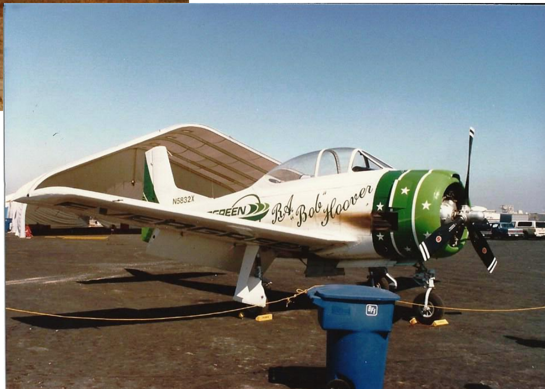
Air Show at EAA 14: Bob Hoover's T-28