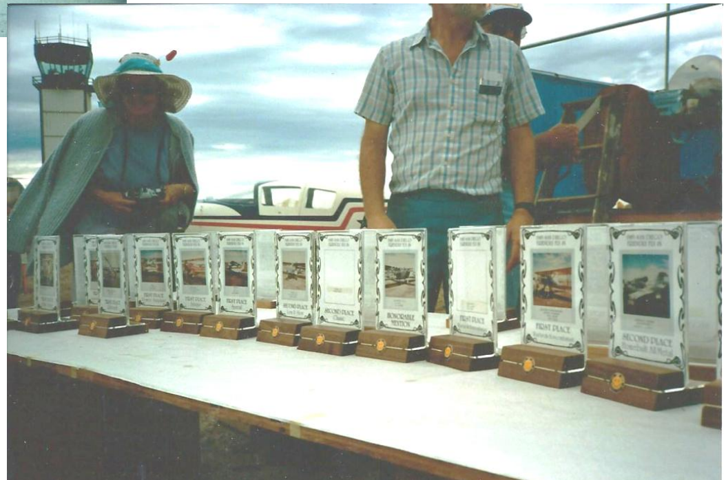
Air Show at EAA 14: Awards