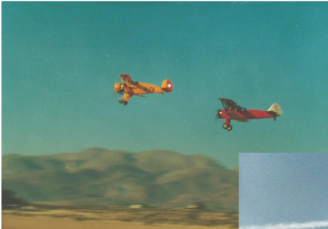
Air Show at EAA 14: Fly-by