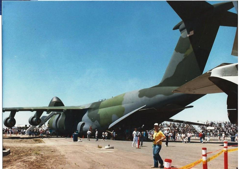
Air Show at EAA 14: Military Aircraft Display