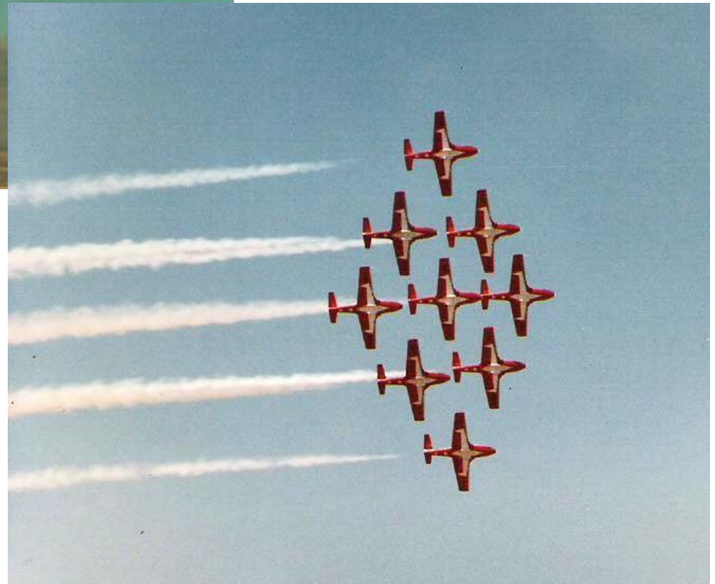
Air Show at EAA 14: Snowbird Demonstration