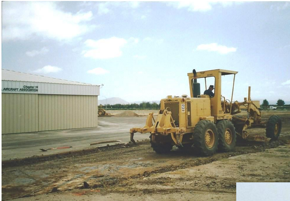
Pavement Issues After the Air Show at EAA 14