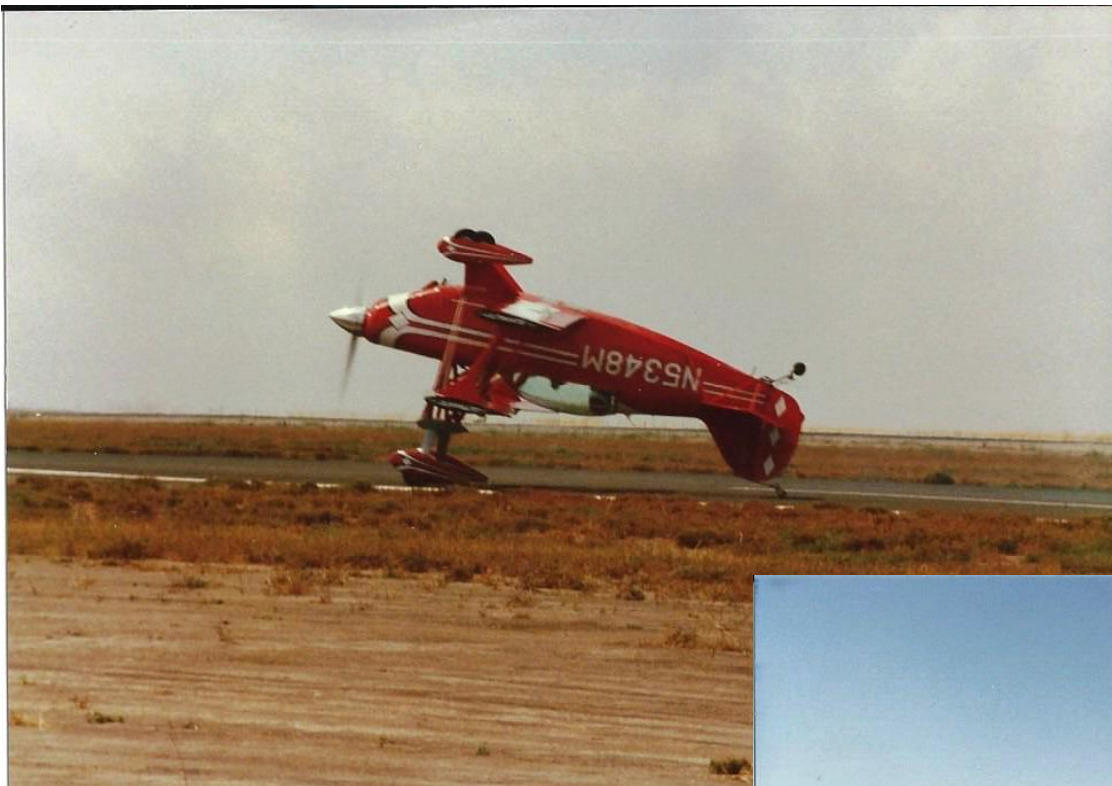
Air Show at EAA 14: Aerobatic Display Aircraft