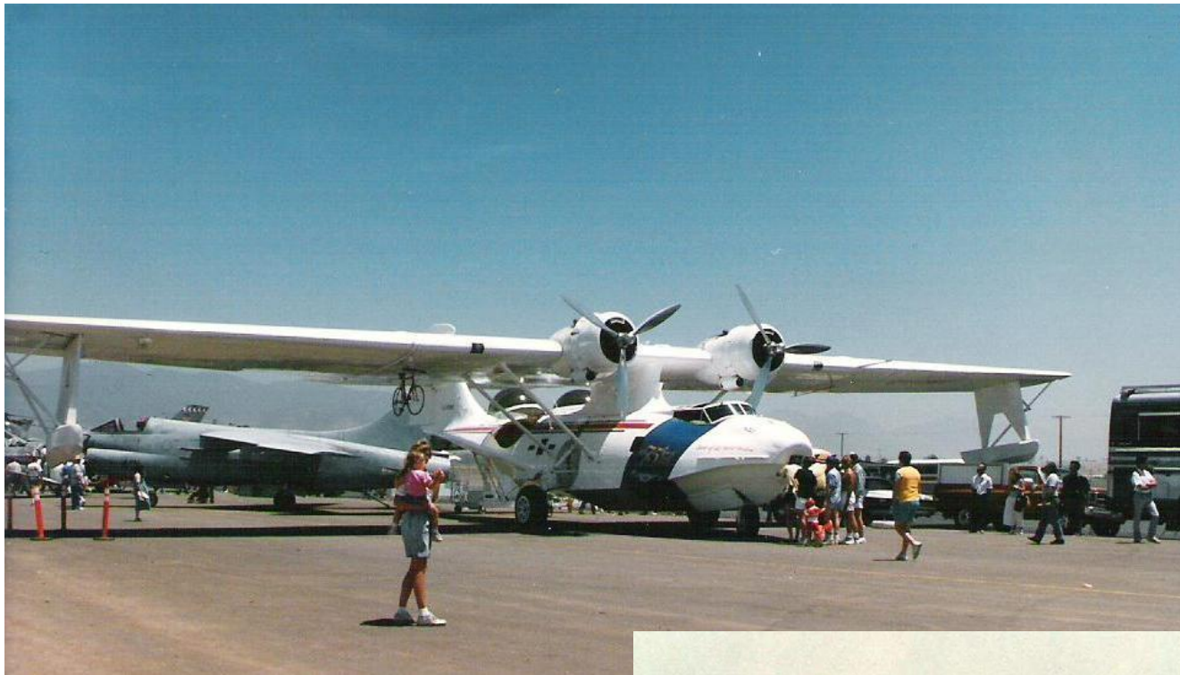
Air Show at EAA 14: Aircraft Display