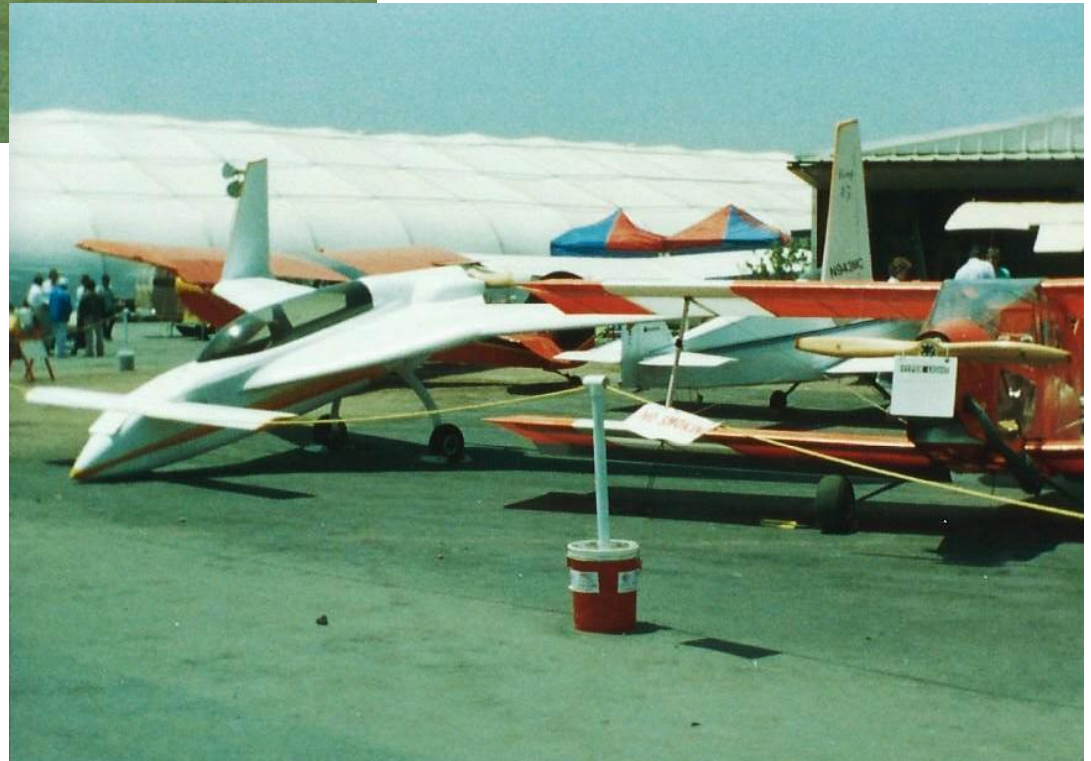
Air Show at EAA 14: Aircraft Display