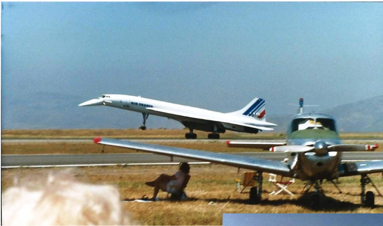
Air Show at EAA 14: The Concorde