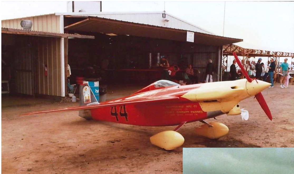
Air Show at EAA 14: Glasair