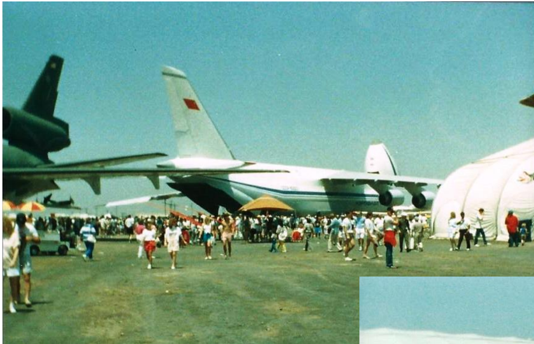
Air Show at EAA 14: Aircraft Display