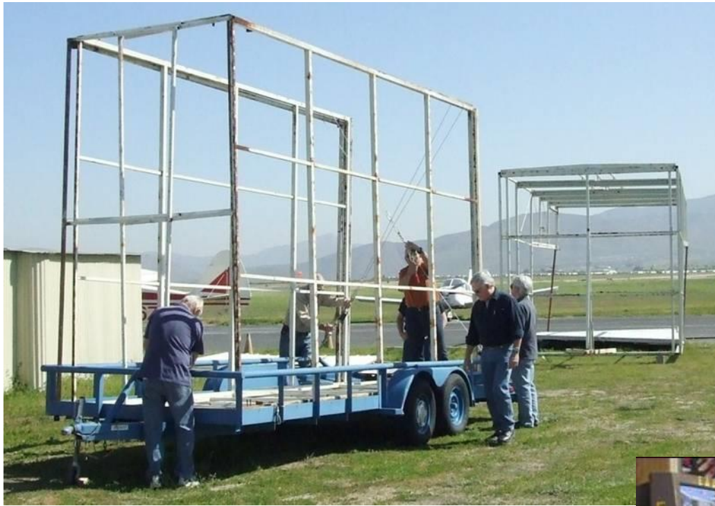
Our work crew unloads a wing box