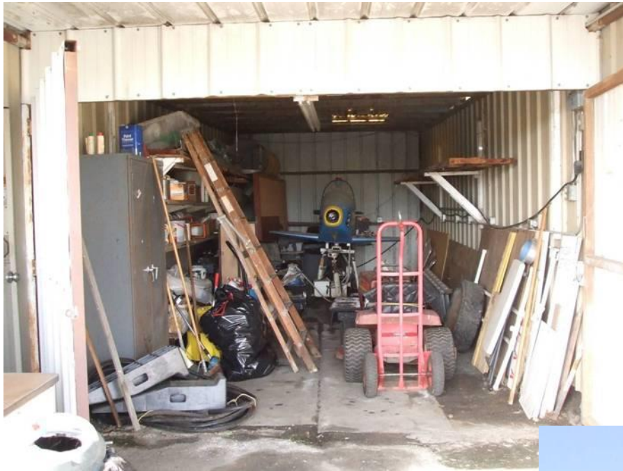
Previous Eagles' Nest space