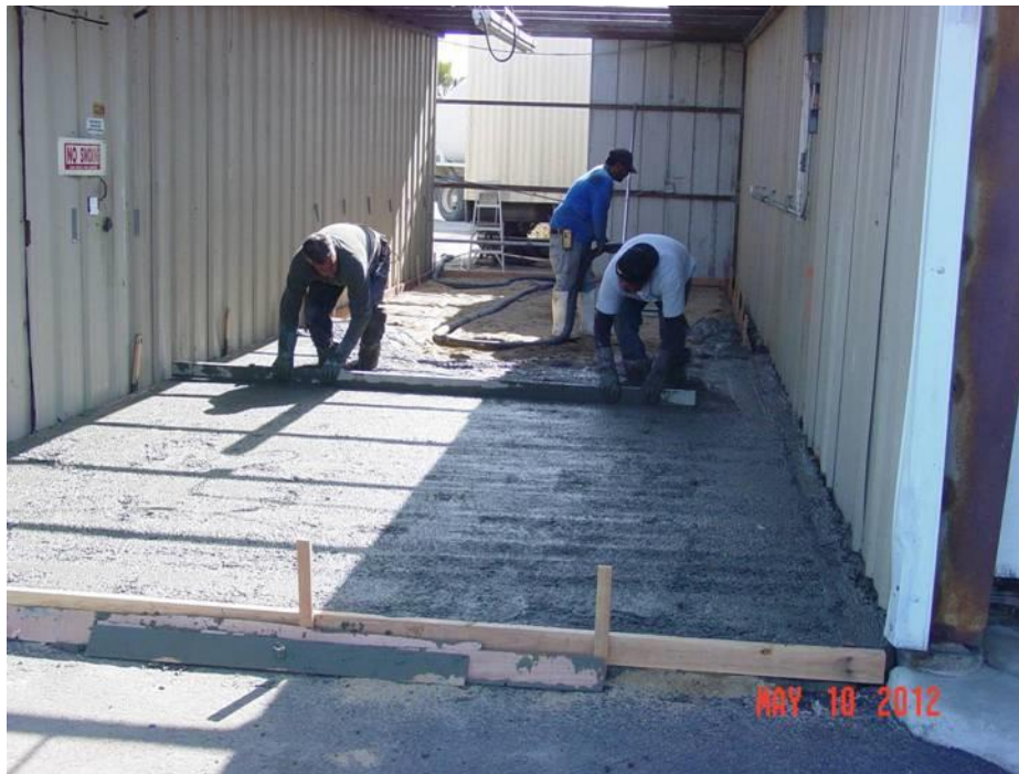
Eagles' Nest slab poured