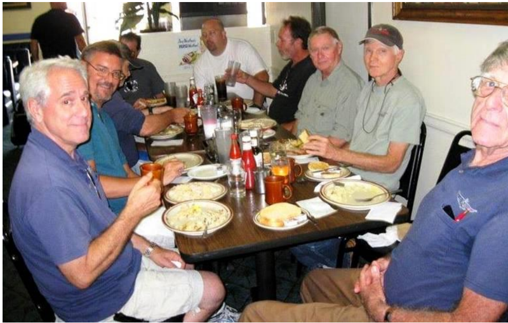
Fly-out group in Riverside