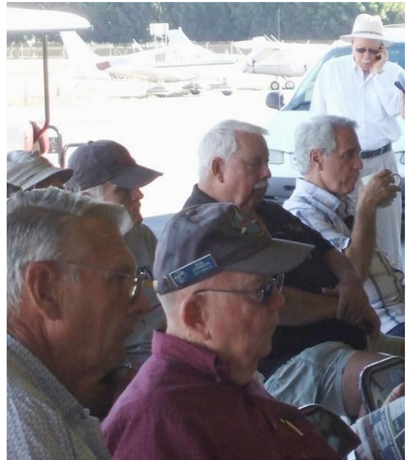
Chapter members listen to Airports Advisory Committee meeting held at the Chapter