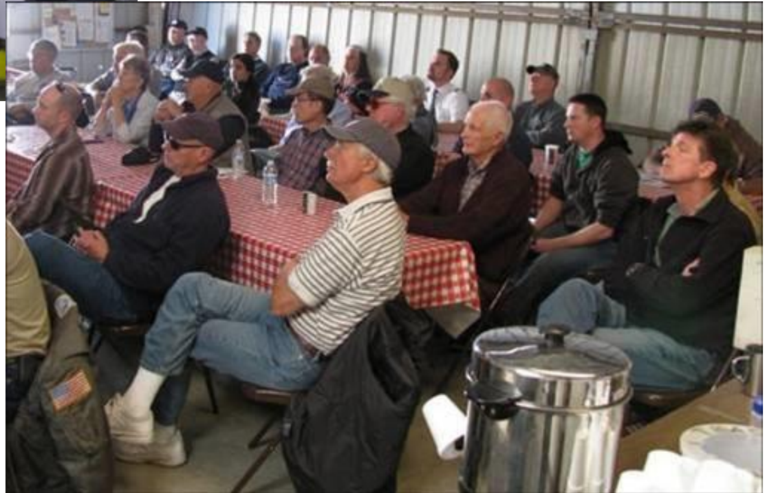
Listening to monthly program speaker