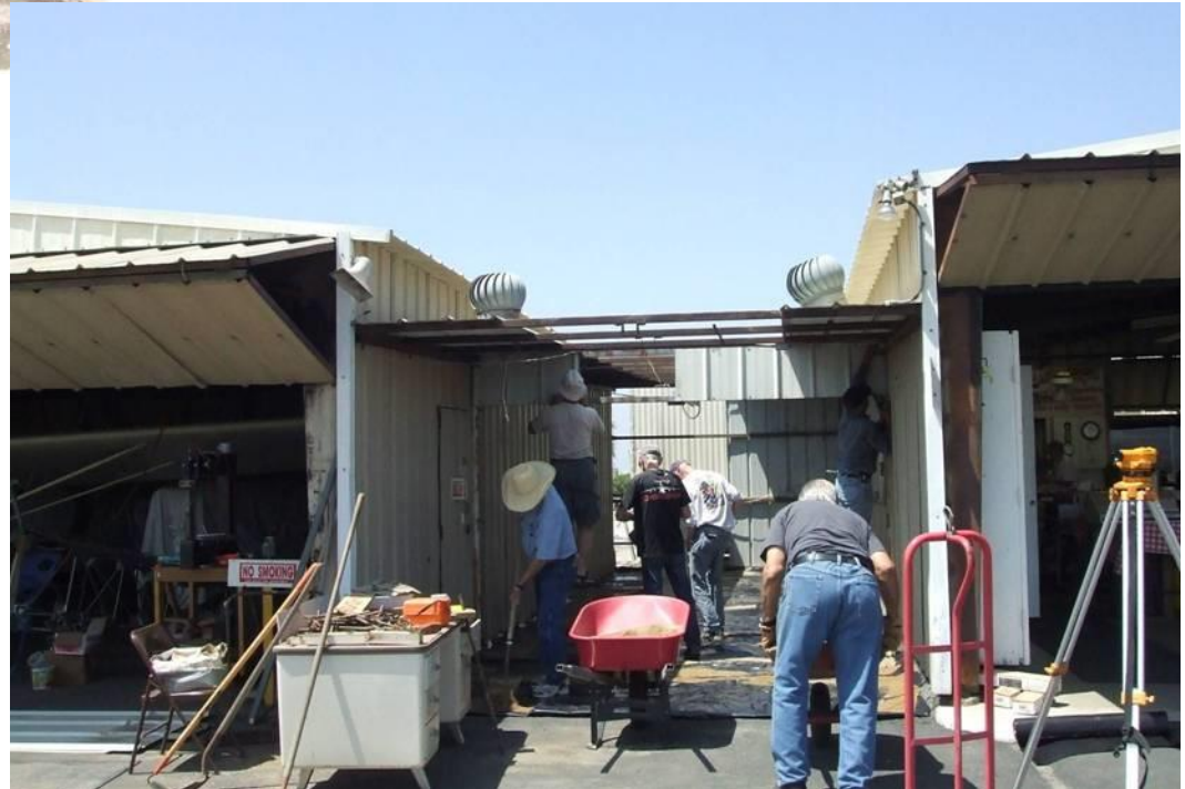
Chapter members prep new YE space