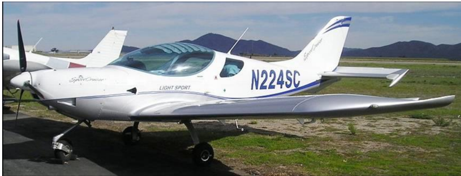
Czech Sport Cruiser

Stits hangar and Stiles hangar in process