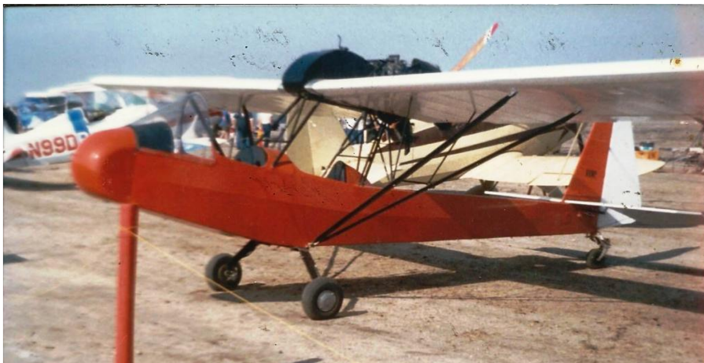
Fly-In: Woody Pusher