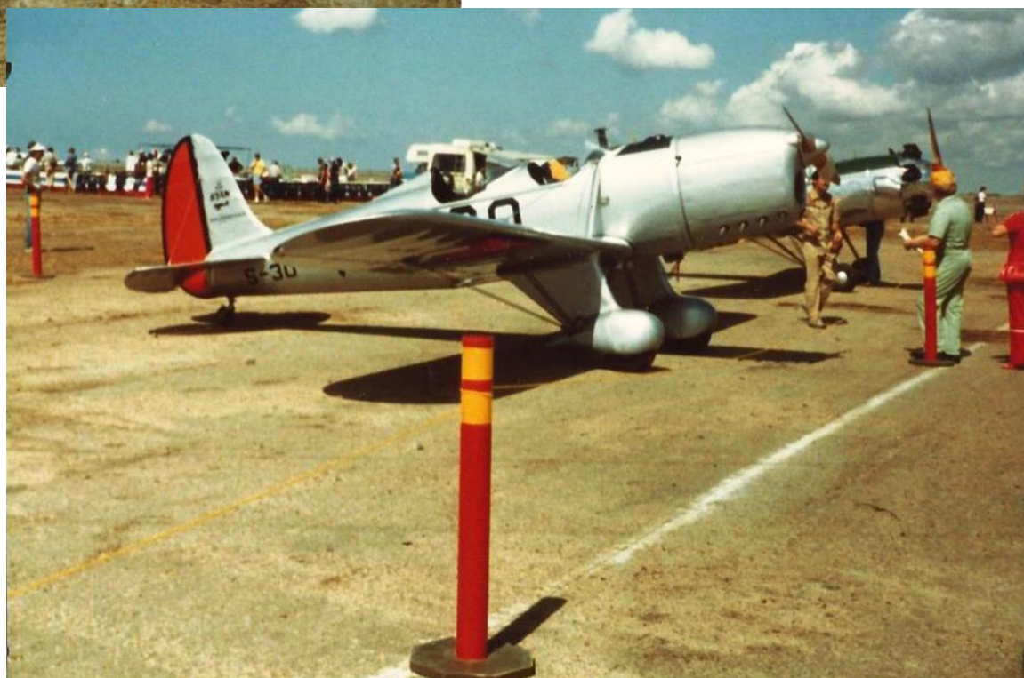
Fly-In: Ryan ST and Ryan PT-22