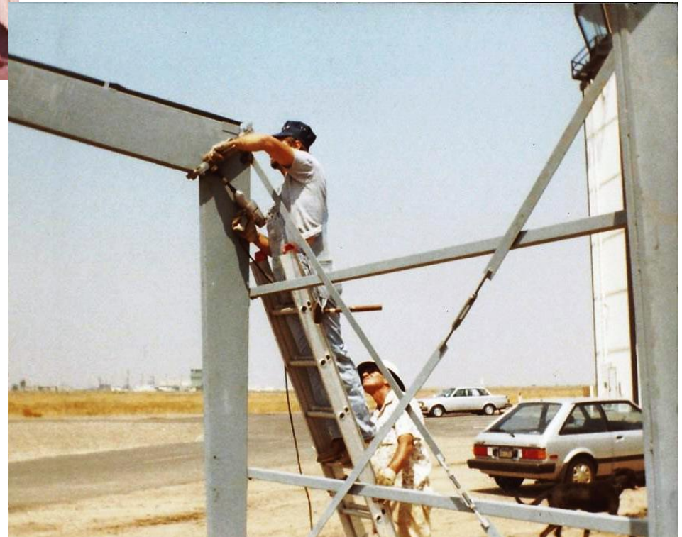
Hangar Build: Making Attachments