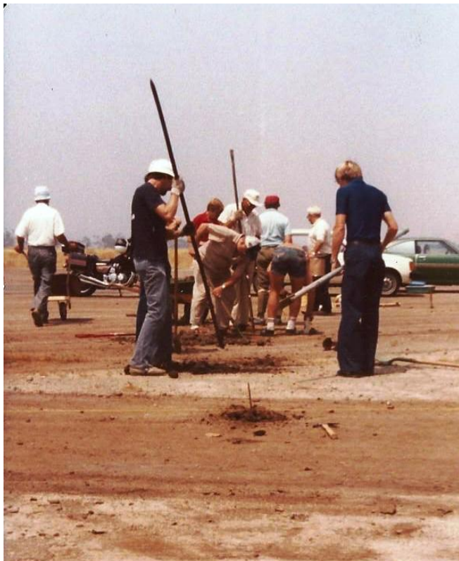
Hangar Build at Brown Field: Digging Post Holes