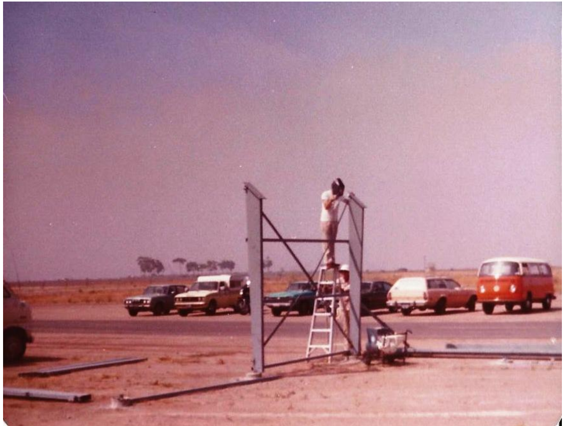
Hangar Build: First Section