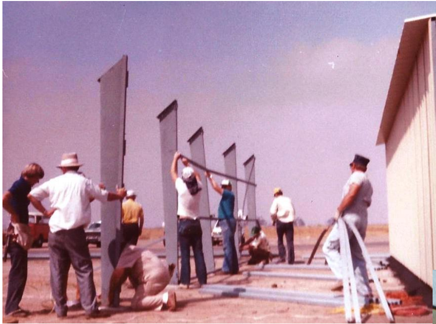
Hangar Build: Attaching the Uprights