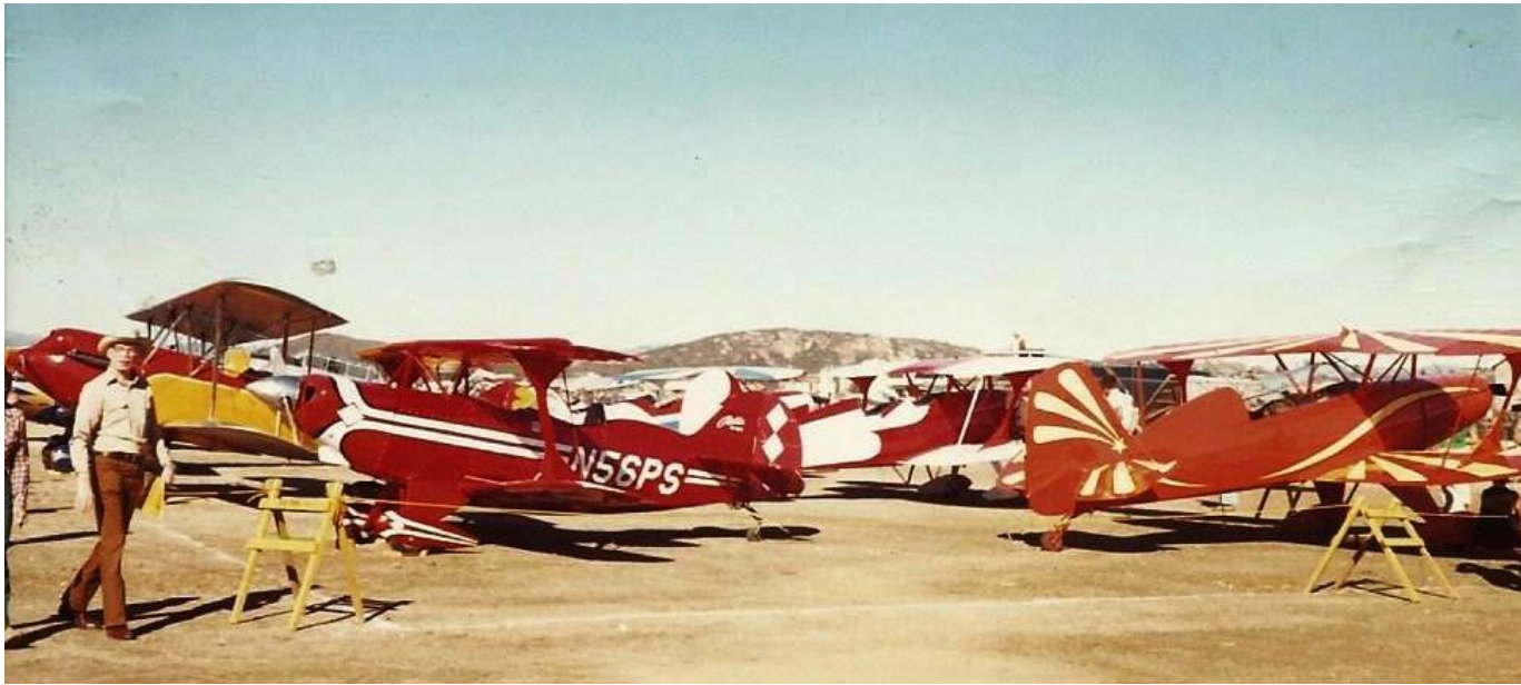
Fly-In: Starduster II