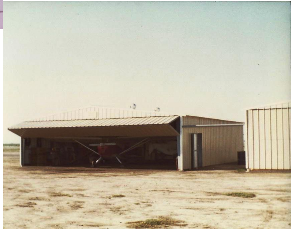
Hangars are Up and in Use