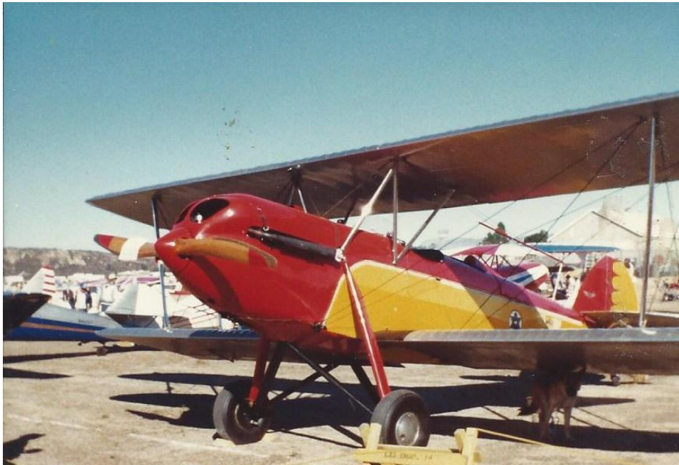
Fly-In: Curtis Ox 5