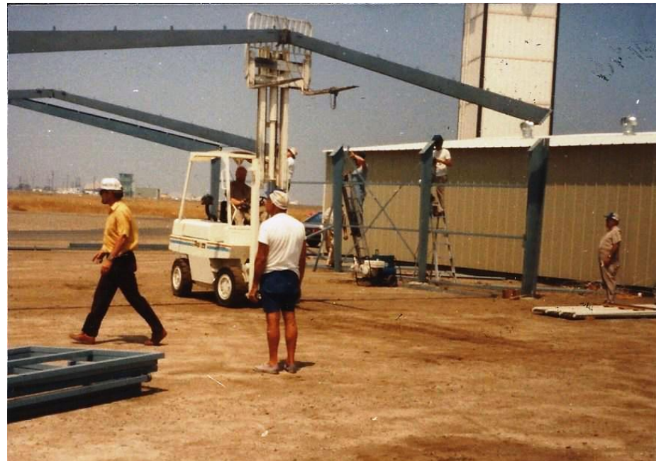
Hangar Build: Lifting the Beams