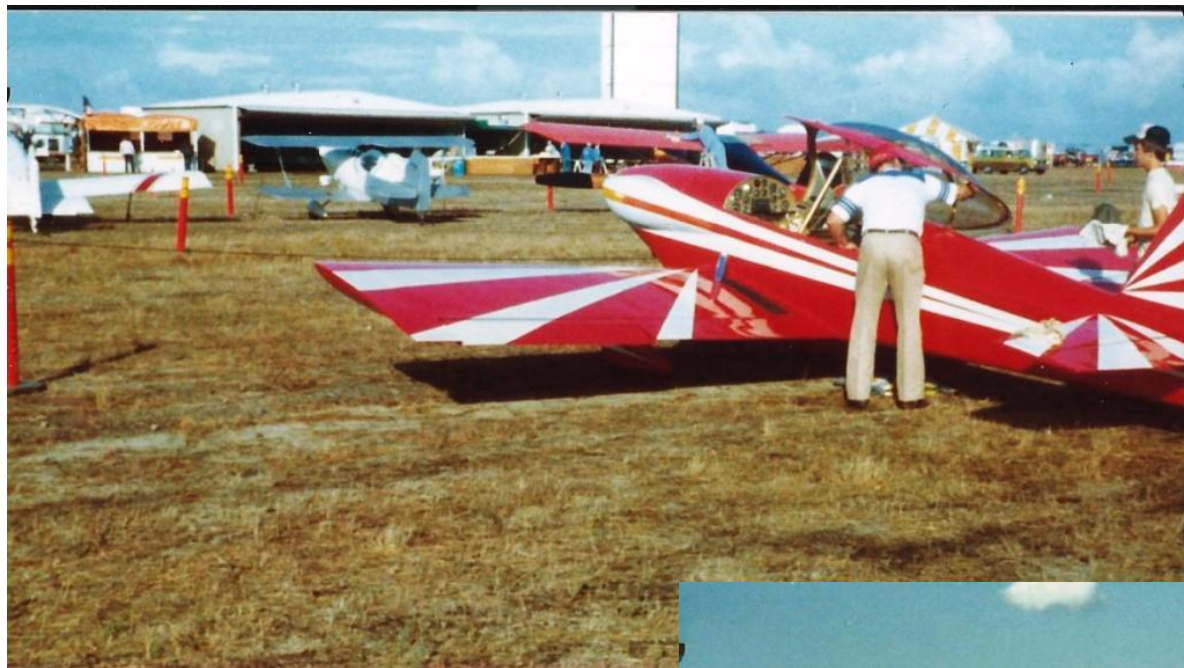
Fly-In: RV-4 Best Low Wing