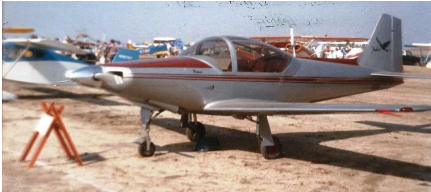
Fly-In: Falco Trike