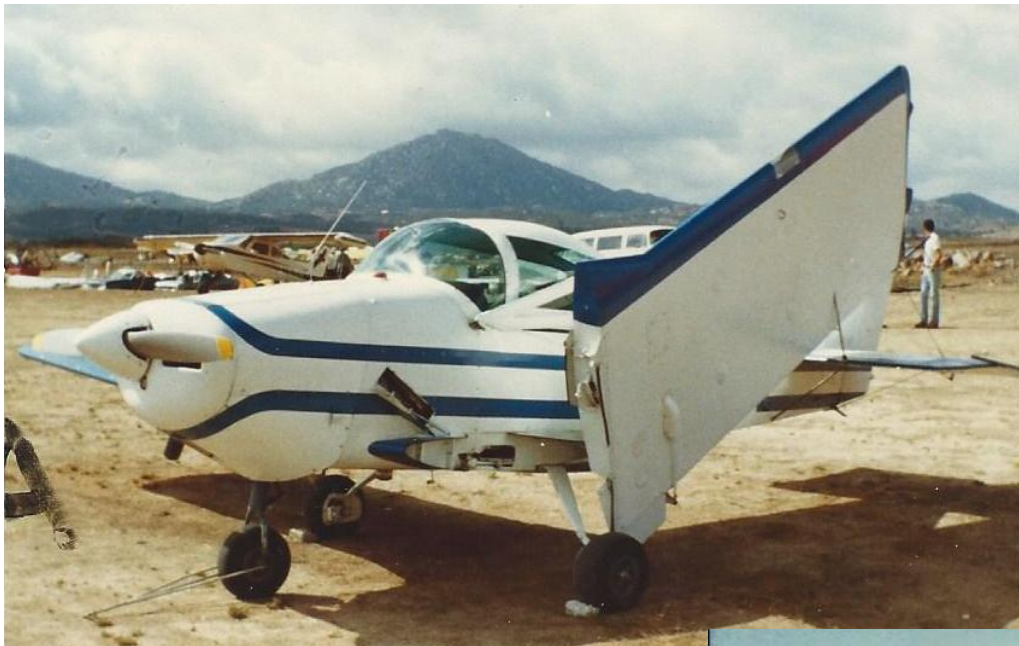
Fly-In: Stits Folding Wing "Playmate"