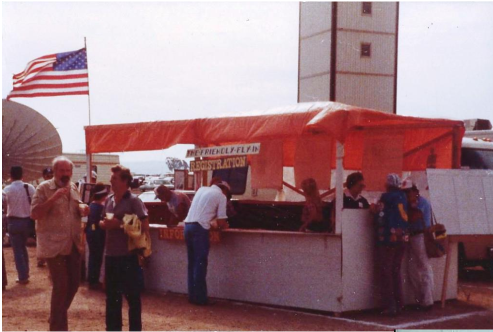
Fly-In at Brown Field: Registration