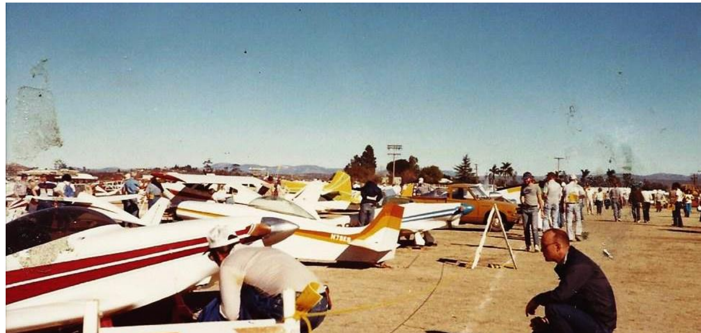
Fly-In: KR Flight Line