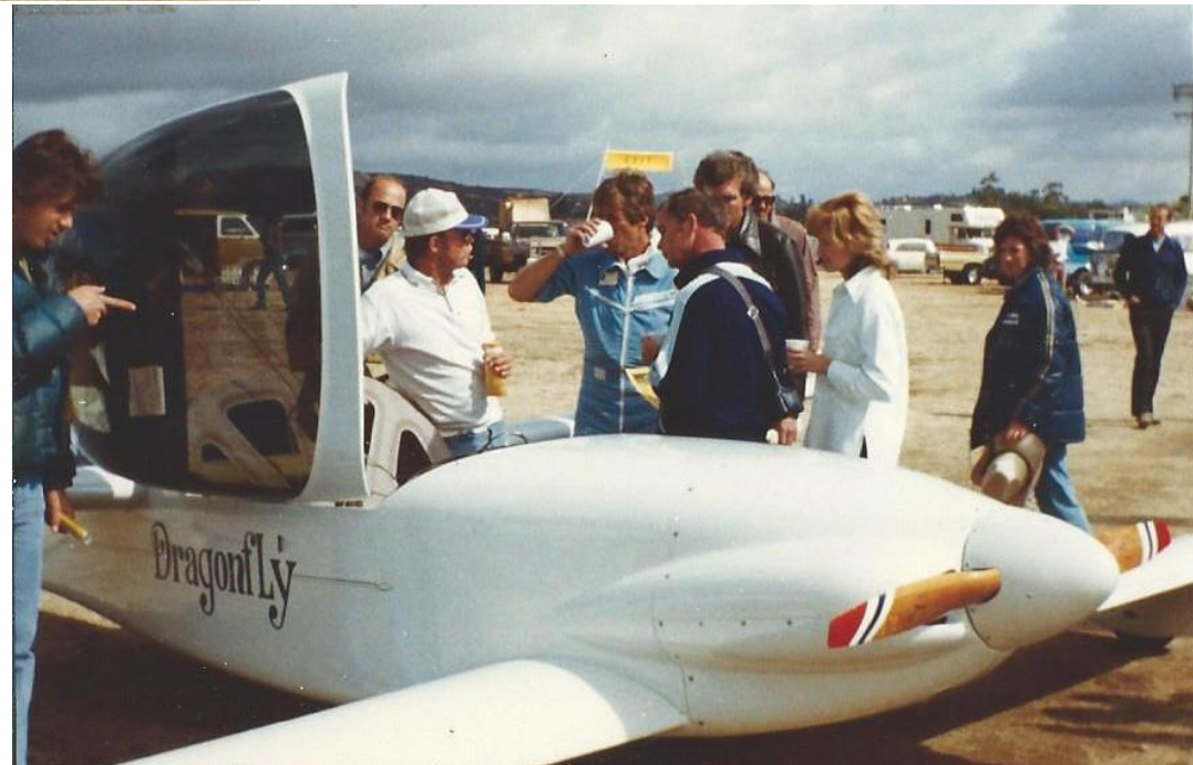
Fly-In: Dragonfly Prototype