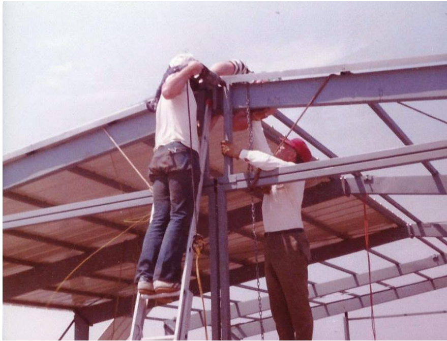
Hangar Build: Anchoring the Roof