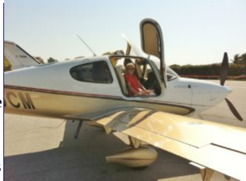
Figure 2: A Cirrus SR22 is a great way to travel the country—especially if you have an instrument rating.

We flew to Yellowstone Park in 2011 and spent several days exploring the park. Mountain flying was exciting also. The airport at Livingston, Montana, was at 6500 ft elevation but the density altitude was 8600 ft that day. The manager at the airport warned me about this as it was normally a problem for most airplanes. I had the Cirrus loaded to max weight with three of us and baggage. It was airborne at about one third of the way down the runway and it climbed out beautifully—a wonderful airplane. We went to 11,000 ft. to clear all mountains and flew for home. By the way, while the rule says use oxygen at 12,500 this is only for a few minutes. Always use oxygen anytime over 10,000 ft; I can't express this strongly enough.