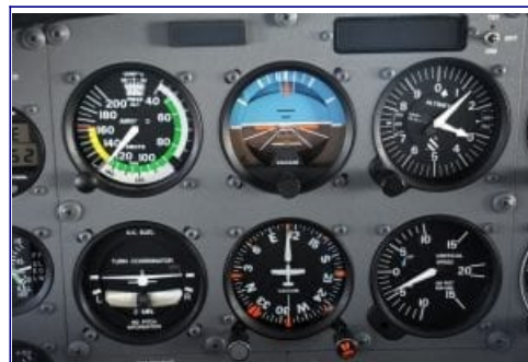
Figure 1: After a while, trusting these instruments becomes second nature.

Once you have the skills to fly instruments it is amazing how easy it is to fly in clouds. In some ways it is easier. Once you have filed a flight plan and started it, ATC really takes care of you. They guide you through airspace and alert you to activity ahead. They help a lot with weather and help with rerouting your course to avoid it. I flew IFR so often that I had to remind myself there was still VFR flying when you have to take care of all of these details by yourself.