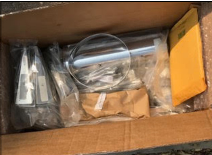
Small pieces are packed in boxes

Most parts are still in the box they were shipped in. Kit does not include engine but does include mount and cowling for Continental IO-240. Cruise 140 kn, range 980 miles, useful load 520 lbs., take off 500 ft., detachable wings, stressed to \pm 9 Gs. Wikipedia provides additional info including a more complete list of specs.