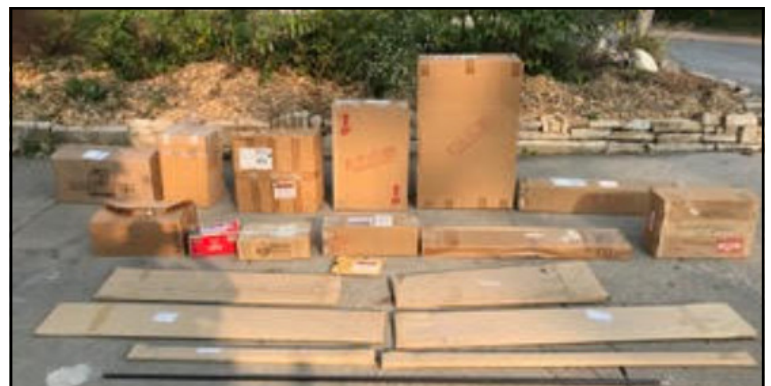
Complete set of boxes containing small parts