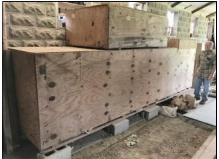
Crates containing canopy, wings, and fuselage