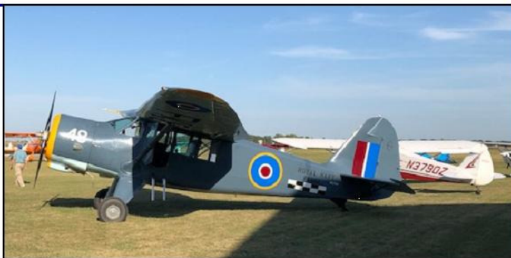
Stinson Gull Wing