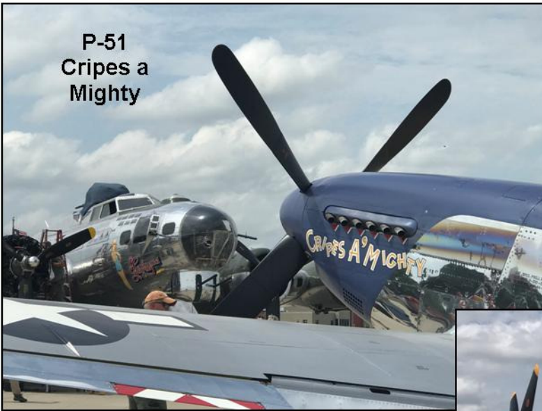
P-51 Cripes a Mighty