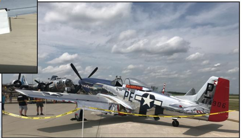
Tuskegee Airmen P-51