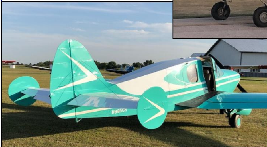
Bellanca from Blakesburg