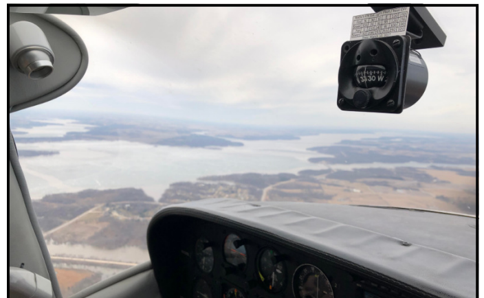
Lake Red Rock on the way to Pella

the national Ercoupe convention this year is in Knoxville, Iowa, June 27-30