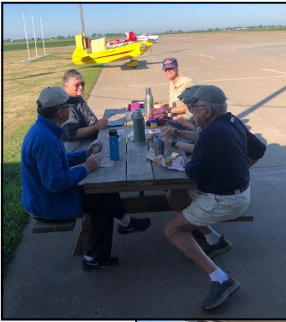
FOGZ (Flying Old Geezers) in Oskaloosa July 13