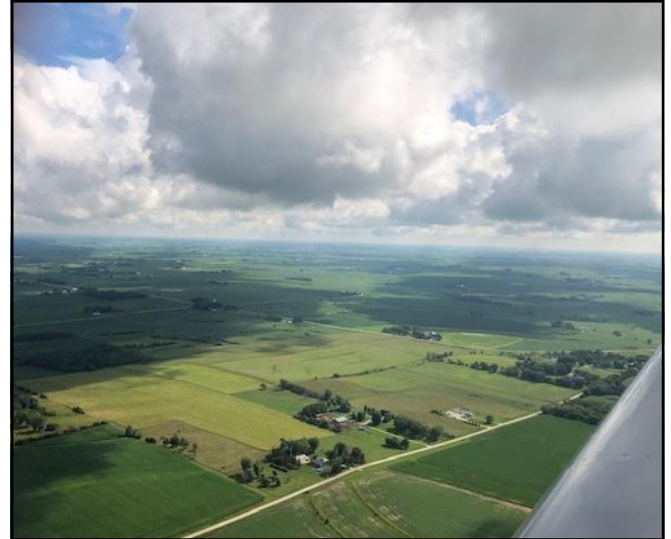
Waverly Flight Breakfast July 17