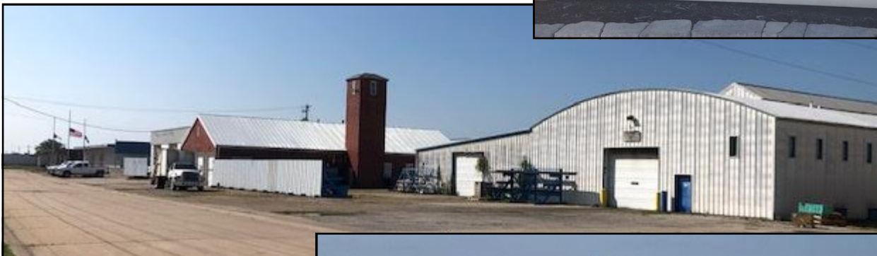
Flight breakfast in Ottumwa July 9