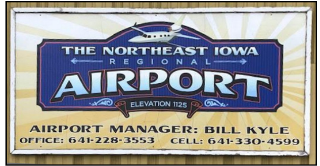
Charles City Flight Breakfast July 17