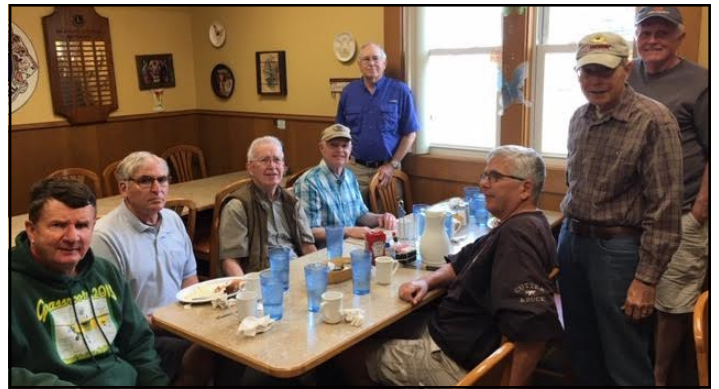
FOGZ (Flying Old Geezers) meet up at a restaurant in Belle Plain