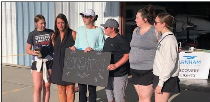
At the Boone Area Pilots' Association Fly-In breakfast on May 14, there was a successful marriage proposal during an airplane ride